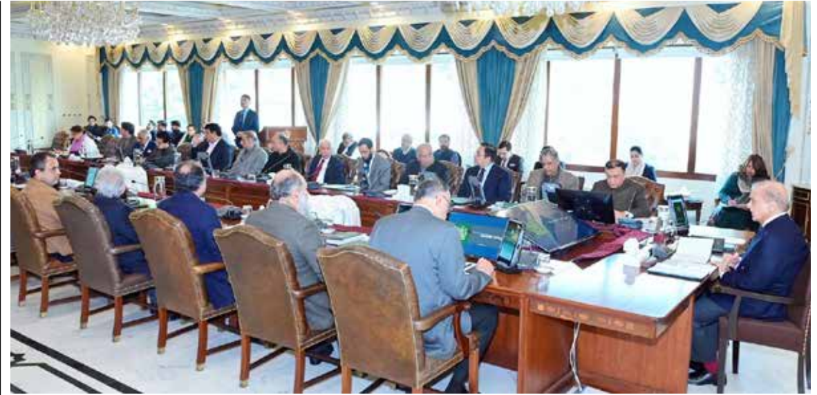
ISLAMABAD: Prime Minister Shehbaz Sharif chairs the federal cabinet meeting.