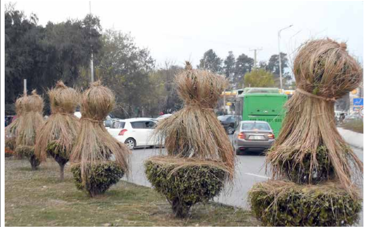
ISLAMABAD: A view of plants covered with dry grass on a green belt to protecting from frost and cold weather, in the Federal Capital.

refugees to keep close vigil eyes inside their camps and inform the relevant authorities while seeing any suspected or unwanted elements among them so that prompt action could be taken against them. The Federal Minister said that sports was playing a key role in bringing people closer and creating tolerance in society. He said that it was good omen that players from all regions of Khyber Pakhtunkhwa attended the Afghan Cricket League played between October 10-27 December 2024 here. He said Islamia College Peshawar plays a key role in promotion of quality education and sports. Earlier, Engr Amir Muqam was warmly received by the Vice Chancellor of Islamia College University, organizers and players upon arrival at the venue. The players were introduced to Engr Amir Muqam who appreciated their performance and distributed prizes and trophies among them.