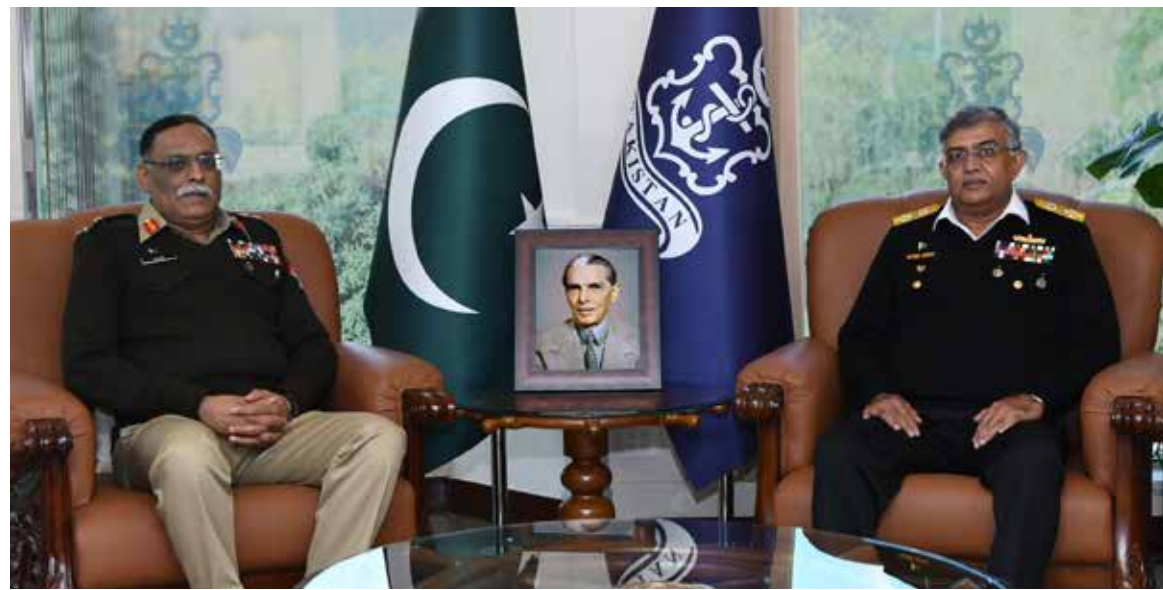
ISLAMABAD: Chairman Joint Chiefs of Staff Committee General Sahir Shamshad Mirza visited Naval Headquarters Islamabad and met Chief of the Naval Staff Admiral Naveed Ashraf.

SEOUL: South Korean authorities began releasing the bodies of plane crash victims to families on Tuesday, as investigators raced to determine why the Jeju Air Boeing 737-800 crash landed and burst into flames. US investigators, including from Boeing, arrived at the crash site in southwestern Muan, officials said, as South Korean authorities began assessing two black boxes retrieved from the burned-out wreckage of the aircraft. The plane was carrying 181 people from Thailand to South Korea when it made a mayday call and belly-landed before crashing into a barrier and bursting into flames. Everyone aboard Jeju Air Flight 2216 was killed, save two flight attendants pulled from the wreckage. South Korea is observing seven days of mourning, with flags flying at half-mast. Acting President Choi Sang-mok, who has only been in office since Friday, said the accident was a "turning point" for the country, calling for a full overhaul of air safety systems. He urged officials to "thoroughly re-examine the overall aircraft operation system... and immediately address any necessary improvements."