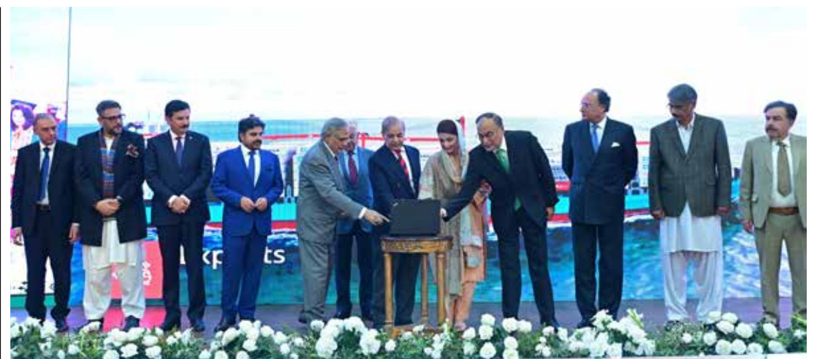
ISLAMABAD: Prime Minister Muhammad Shehbaz Sharif inaugurating the logo & website of the National Economic Transformation Plan 2024-2029, titled "Uraan Pakistan".

ISLAMABAD: Federal Minister for Information, Broadcasting, National Heritage and Culture Attaullah Tarar said on Tuesday that the prime minister's homegrown economic reforms package will significantly improve citizens' lives, stimulate growth, and strengthen the economy. In an exclusive statement regarding the prime minister's five-year National Economic Transformation Plan 2024-29, titled "Udan Pakistan: Homegrown National Economic Plan," Tarar revealed that Prime Minister Shehbaz Sharif will unveil the ambitious agenda today. Tarar stated that Pakistan has moved from the verge of default to stability and is now on the path to progress. He expressed gratitude, highlighting improvements in all economic indicators. Describing the Home-Grown Economic Agenda as a reform-driven plan centered on "Made in Pakistan," Tarar stressed its vital role in fostering economic growth and bringing positive change to the people of Pakistan. The economic reform agenda is designed to accelerate the country's development and ensure the prosperity of its citizens.