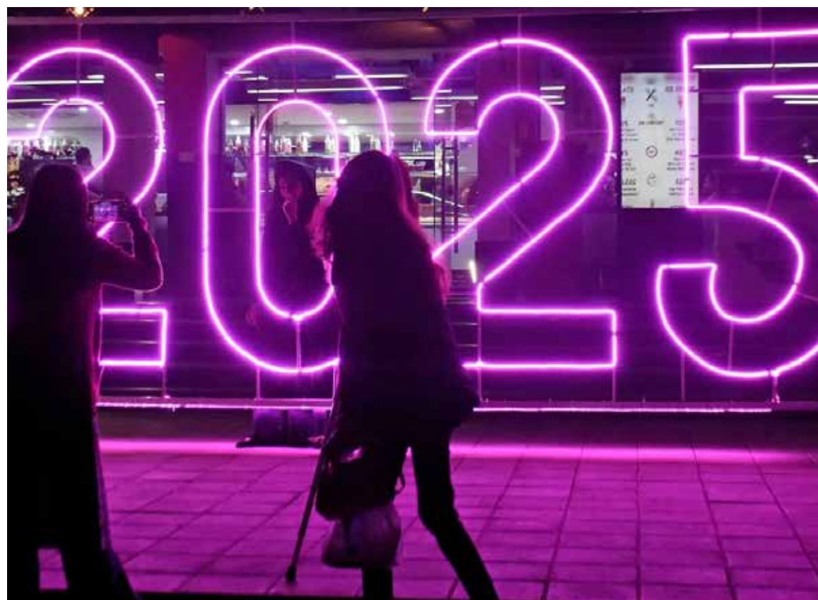
ISLAMABAD: Girls celebrating in front of welcome 2025 sign displayed alongside a road at Blue area.