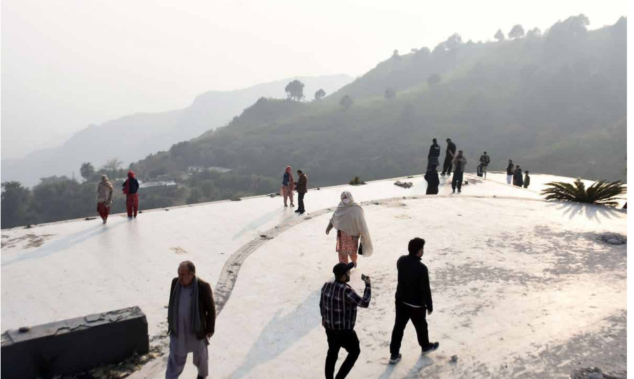
ISLAMABAD: Picnickers enjoying pleasant weather at old side of Monal restaurant at Peer Sohawa area, in the Federal Capital