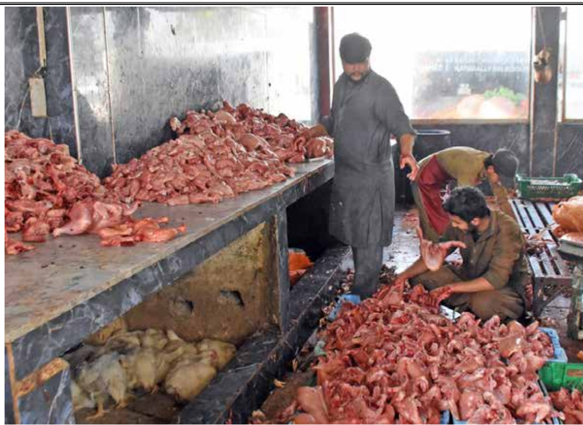
ISLAMABAD: Butchers preparing chicken meat for customers at his shop in the Federal Capital.

tions, and SAARC visa processing have been doubled. This is not justified and should be reversed without delay. He said that most trade bodies are resolving their issues without the help of FPCCI, as its leaders are fully focused on self-projection and rewarding un-elected favorites by wasting millions of rupees, which should be stopped immediately.