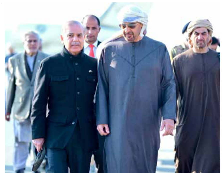
RAHIM YAR KHAN: Prime Minister Muhammad Shehbaz Sharif meets the President of U.A.E., His Highness Sheikh Mohammed bin Zayed Al Nahyan, in Rahim Yar Khan.