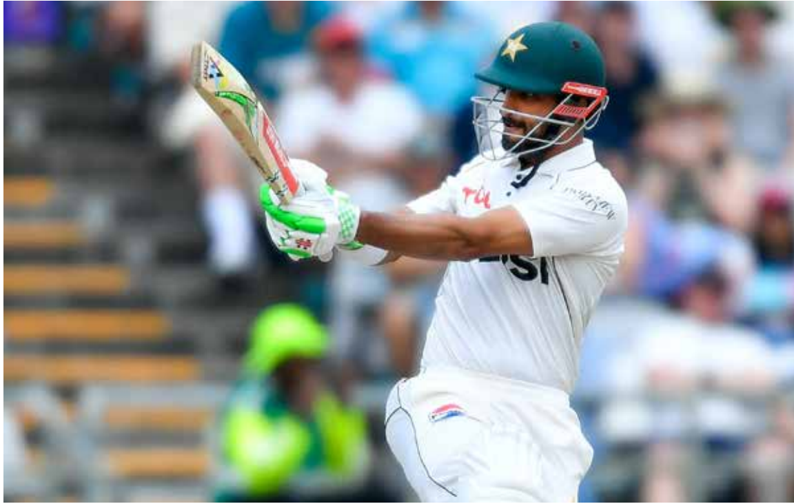
CAPE TOWN: Pakistan captain Shan Masood went on to score his sixth Test century and remained unbeaten on 102 at the day end. - DNA

NEW DELHI: Indian security forces on Sunday battled with Maoist rebels in their forested heartland, police said, with at least four guerrillas and one policeman killed. More than 10,000 people have died in the decades-long insurgency waged by Naxalite rebels, who say they are fighting for the rights of marginalized indigenous people in India's resource-rich central regions. Government forces stepped up efforts last year to crush the long-running armed conflict, with some 287 rebels killed in 2024, according to government figures. Clashes broke out late Saturday in Abujmahar district of Chhattisgarh state, a key battleground in the insurgency. "Four bodies of Maoists, who were in their battle uniform, have been recovered after an encounter with police forces," police inspector general P. Sunderraj said, adding one police constable had also been killed. "Action is still on," he said. Around 1,000 suspected Naxalites were arrested and 837 surrendered during 2024. Amit Shah, India's interior minister, warned the Maoist rebels in September to surrender or face an "all-out" assault, saying the government expected to quash the insurgency by early 2026. - Agencies