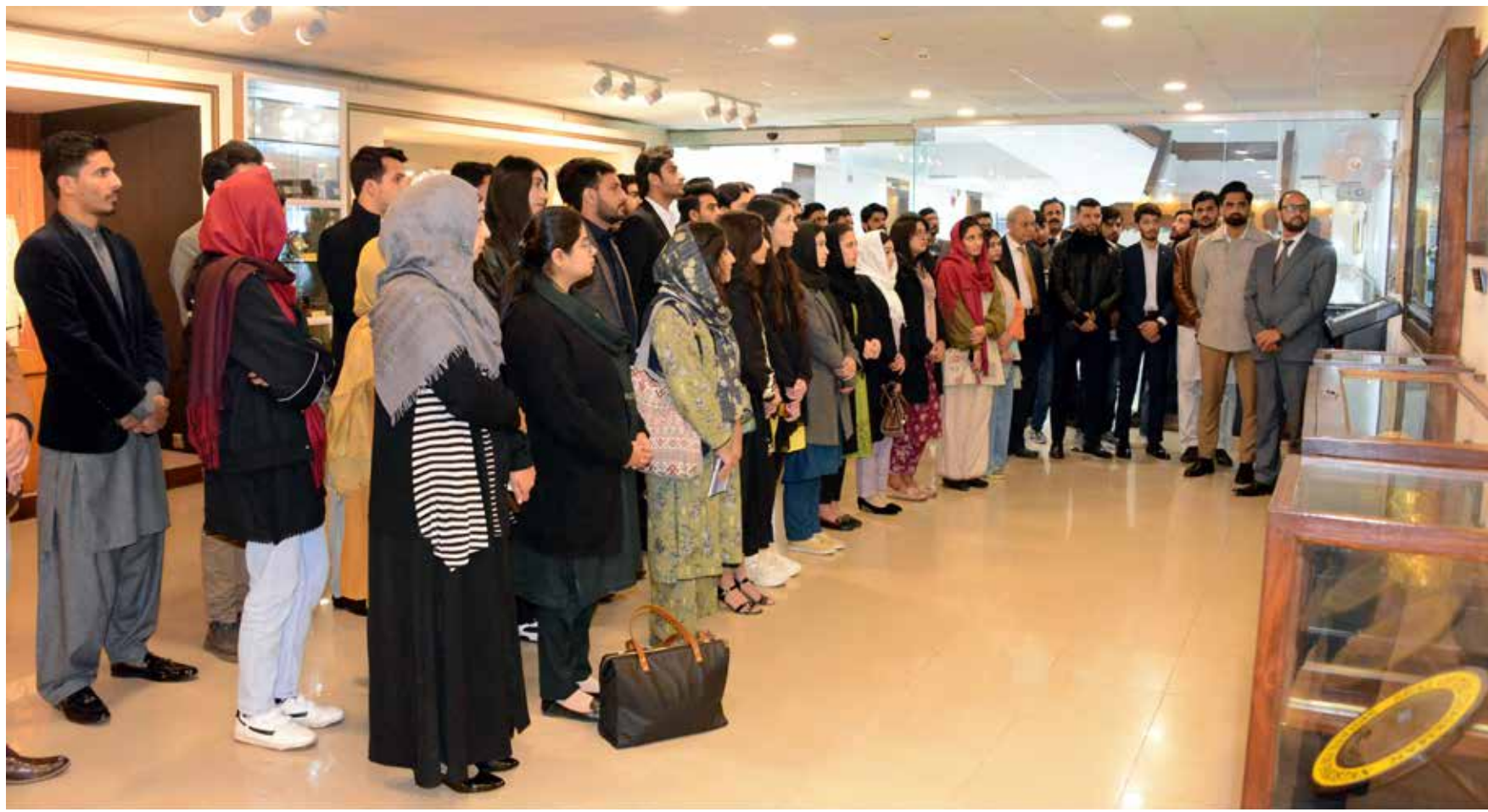
ISLAMABAD: Students and faculty members of Quaid-e-Azam university being briefed about Senate Museum At Parliament House.