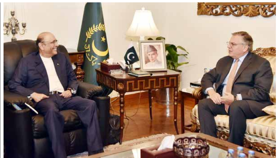
ISLAMABAD: The outgoing Ambassador of the United States of America, Mr Donald Blome, paid a farewell call on President Asif Ali Zardari at Aiwan-e-Sadr.