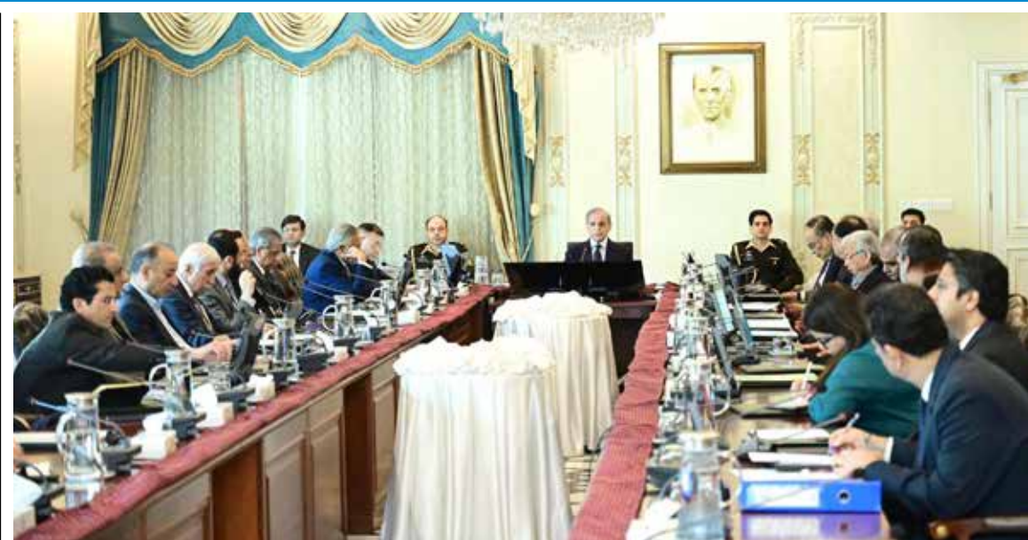
ISLAMABAD: Prime Minister Shehbaz Sharif chairs the Federal Cabinet Meeting. – DNA