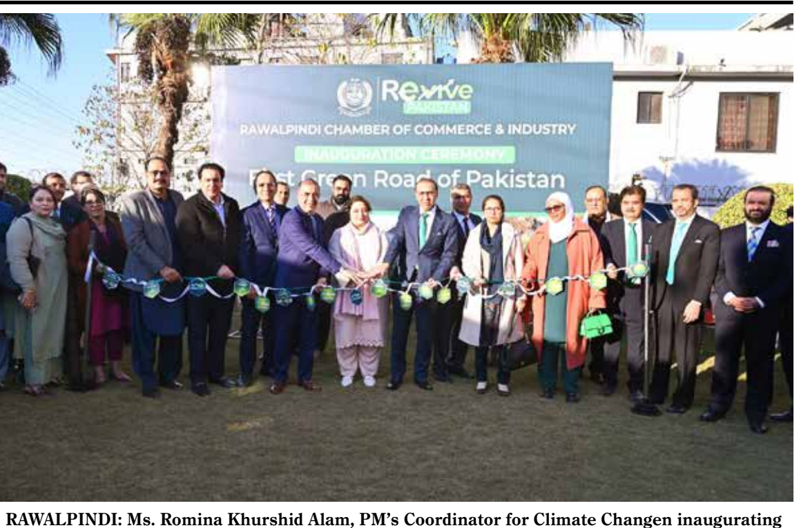
of the First Green Road of Pakistan, under RCCI's Revive Pakistan Initiative.