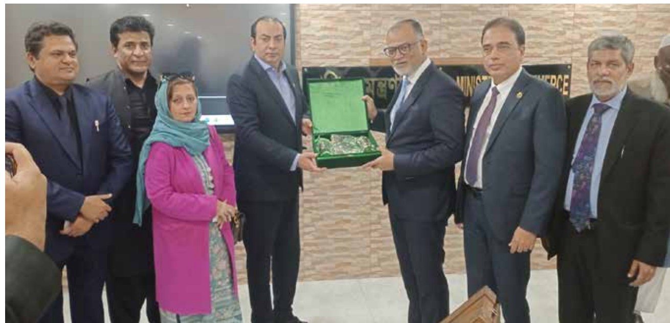
DHAKA: President FPCCI Atif Ikram met with SK. Bashiruddin, Minister of Commerce Bangladesh, at the Ministry of Commerce in Dhaka, Bangladesh. Meeting highlights the growing economic ties between Pakistan and Bangladesh.

DHAKA: A Pakistani trade delegation, led by the President of the Federation of Pakistan Chambers of Commerce and Industry (FPCCI), Atif Ikram Sheikh, visited Bangladesh after a 12-year hiatus. The visit emphasised enhancing bilateral economic relations and boosting investments between the two nations. According to a statement from FPCCI, the delegation met with Sheikh Bashiruddin, Bangladesh's Minister for Commerce. The Pakistani representatives stressed the importance of increasing economic ties and investment opportunities between the two countries. FPCCI President Atif Ikram Sheikh noted, "This is the beginning of a new era, and we will stand by Bangladesh at every turn." He also highlighted that Bangladesh's Minister for Commerce had expressed a commitment to prioritising trade relations with Pakistan. FPCCI Senior Vice President, Saqib FyazMagoo, welcomed the easing of visa conditions for Pakistanis by Bangladesh, urging the issuance of long-term visas to the Pakistani business community. He added that Pakistan had also relaxed visa restrictions for Bangladesh nationals. Bangladesh's Minister for Commerce, Sheikh Bashiruddin, emphasised, "We will