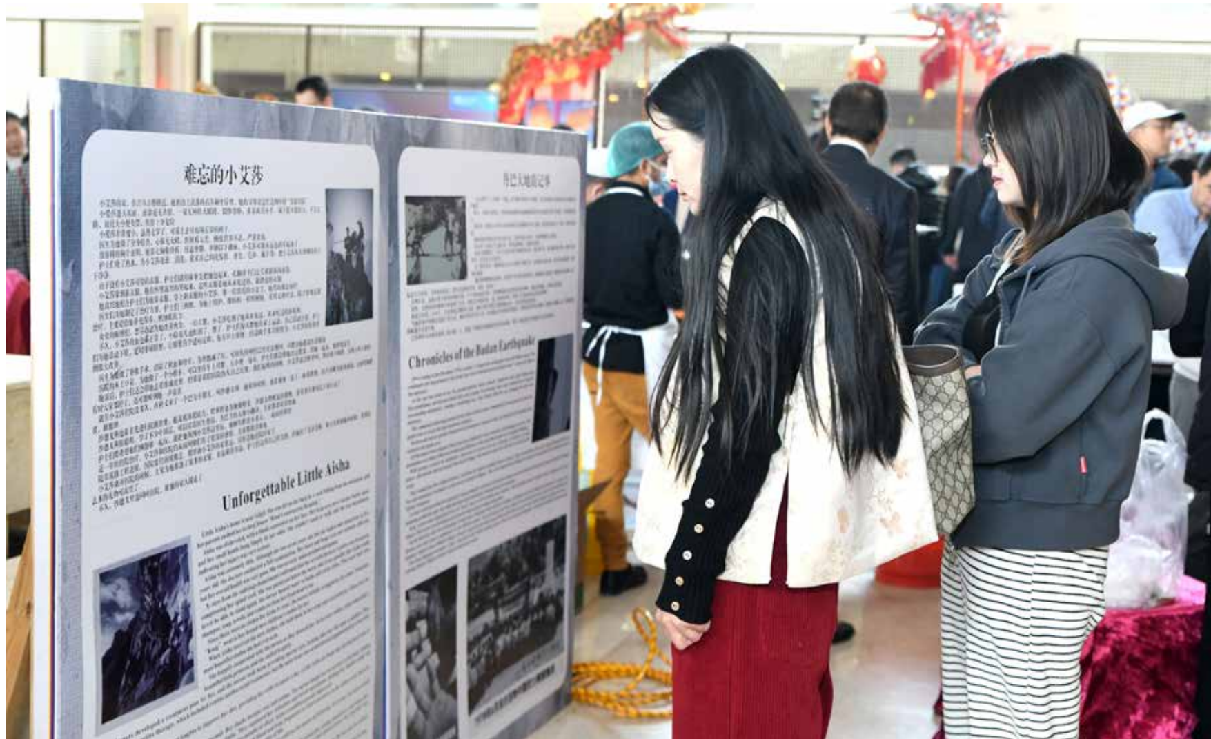
ISLAMABAD: Visitors taking interest in informative materials displayed on the occasion of Chinese New Year celebrations.

RAWALPINDI: Having its pros and cons on society and economy, street vending has grabbed prominence in the society, at the same time creating important market linkages as well as causing revenue gaps for country's economy. Categorized into moveable and static types, the impactful street vending had always been a vital entrepreneurial arc around the sector markets while subtending central focus on targeted population. The sonarant carts loaded with goods or food items move through streets with melodious calls by the hawkers that reflect an announcement for door step delivery of the goods. On the other hand, static stalls decorated with a range of products that sur-