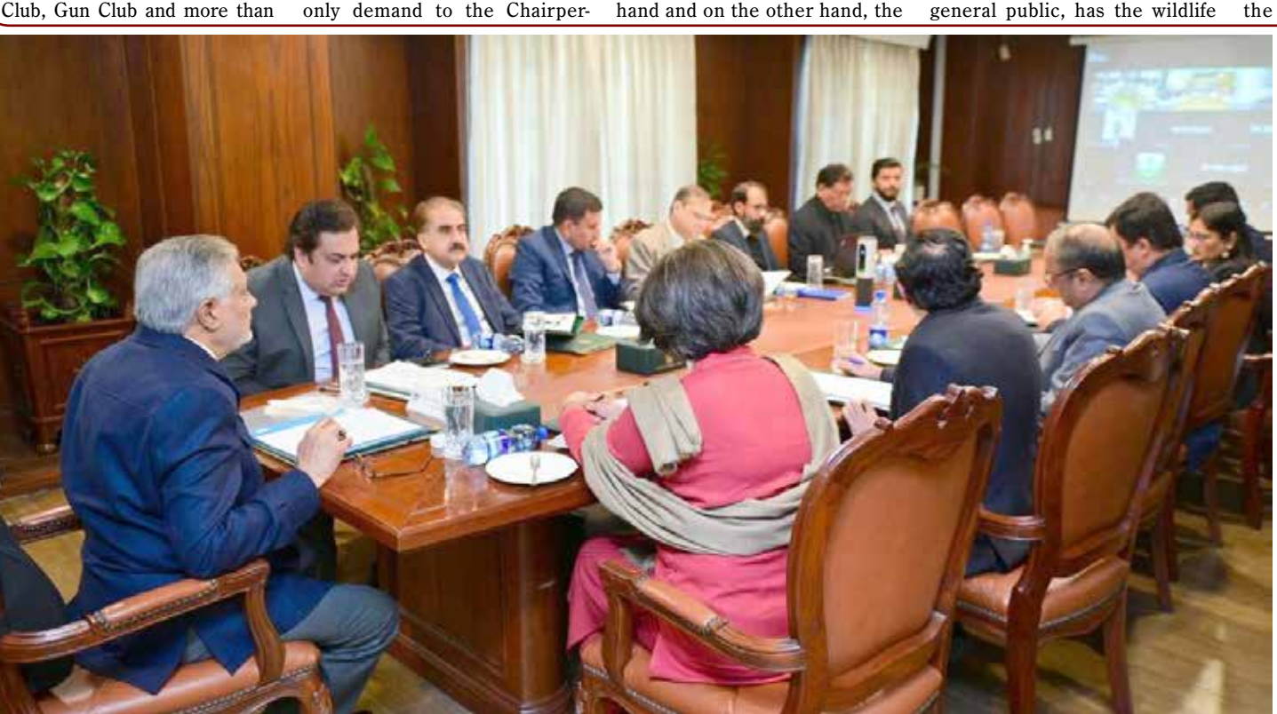
ISLAMABAD: Deputy Prime Minister/Foreign Minister Senator Mohammad Ishaq Dar chaired a meeting of the working group on establishment of textile parks in Pakistan. The meeting was attended by the Minister of Investment, Provincial Ministers, Secretary Ministry of Foreign Affairs, Secretary Ministry of Industry, Secretary Board of Investment, Secretary Special Investment Facilitation Council and other high officials.—DNA