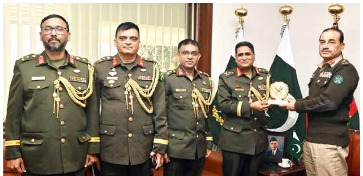
RAWALPINDI: Army Chief General Syed Asim Munir presenting a commemorative memento to Chief of Army Staff (CAS) of the Bangladesh Army, Lieutenant General S M Kamr-ul-Hassan, during a meeting. - DNA

ISLAMABAD: The federal government is expected to raise petrol price by Rs 3.50 per litre for the next fortnight, effective January 16, 2025. In addition, light speed diesel may see a price hike of Rs 5, while kerosene oil price could increase by more than Rs 6 due to fluctuations in the global market. The petroleum industry has submitted a working paper to the Oil and Gas Regulatory Authority (OGRA) detailing the proposed price adjustments. - DNA