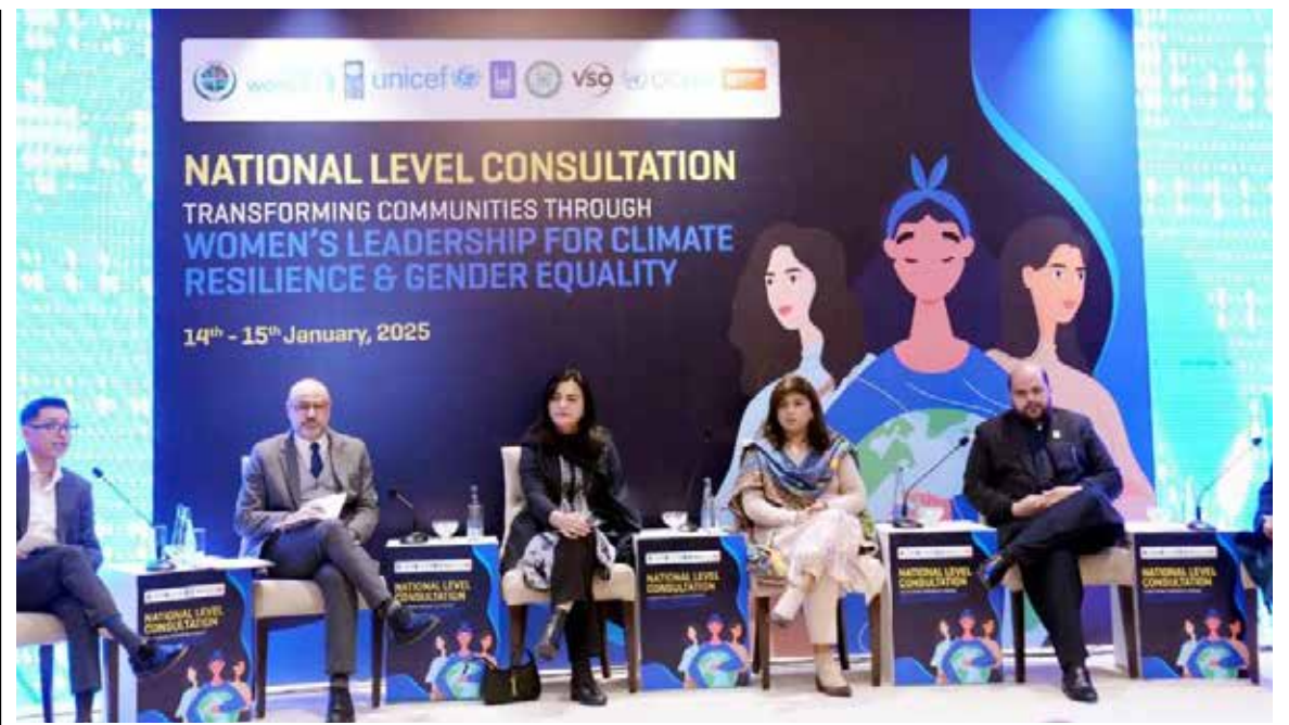
ISLAMABAD: NDMA's Gender & Child Cell (GCC) collaborated with Gender Task Force and UN agencies hosted a two-day National Level Consultation titled "Transforming Communities through Women and Girls' Leadership for Climate Resilience and Gender Equality."