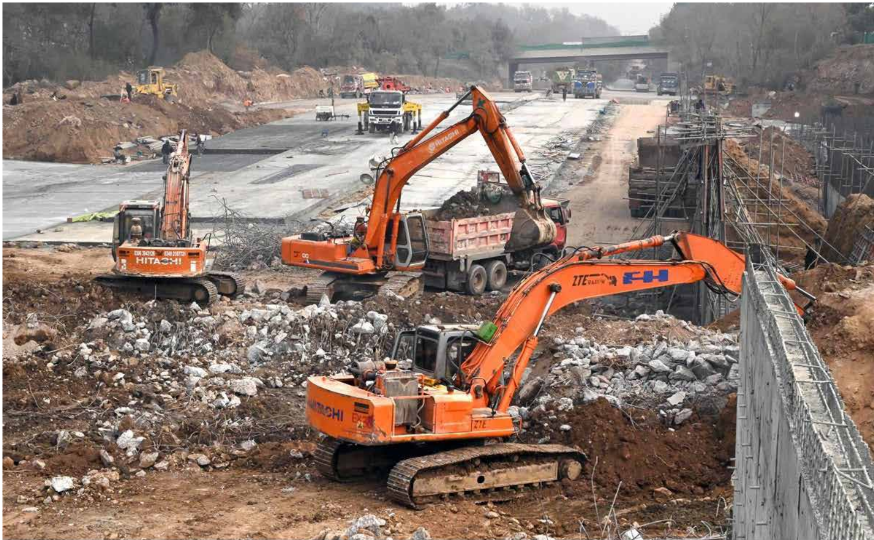
ISLAMABAD: Heavy machinery being used for construction work of Serena Chowk Underpass Project during development work in Federal Capital.

ISLAMABAD: The thirteenth death anniversary of the youngest Microsoft Certified Professional in the world, Arfa Karim Randhawa, was observed on Tuesday. Arfa Karim was born in a small village near Faisalabad on February 2, 1995. Arfa Karim became the youngest Microsoft Certified Professional (MCP) by passing the MCP examination at the age of just nine in 2004. Microsoft owner Bill Gates invited her to visit the company's headquarters in the United States when she was 10. She won many awards and international recognitions for her brilliance in the world of Information Technology (IT).—APP