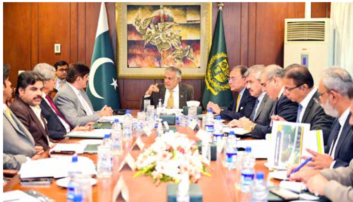
ISLAMABAD: Chief Minister Sindh Syed Murad Ali Shah calls on the DPM/FM Ishaq Dar in his office. He was accompanied by Syed Naveed Qamar as well as Sindh Planning Minister, Chief Secretary Sindh and others.

TEHRAN: Just days before Donald Trump is set to return to the White House, Iran's president has reiterated his country's categorical denial of being part of a plot to kill Trump during his election campaign last year. Iranian President Masoud Pezeshkian made the remarks in his first interview with a US media outlet since Trump survived an assassination attempt last July, and also after the US Justice Department in November charged an Iranian man in connection with a plot to kill Trump the previous month. Trump won the election on November 5 and is set to take office next Monday. "We have never attempted this to begin with, and we never will," Pezeshkian told NBC News in an interview in Tehran on Tuesday. He went on to say that accusations that Iran tried to assassinate Trump are part of "schemes by foreigners" — referring to Israel and other countries — to "feed into Iranophobia." On relations with the US and the tension with the Iranian nuclear issue, along with the recent threats by Trump to increase sanctions and put more pressure on Iran, Pezeshkian charged that the US had "attempted to topple Iran". — Agencies