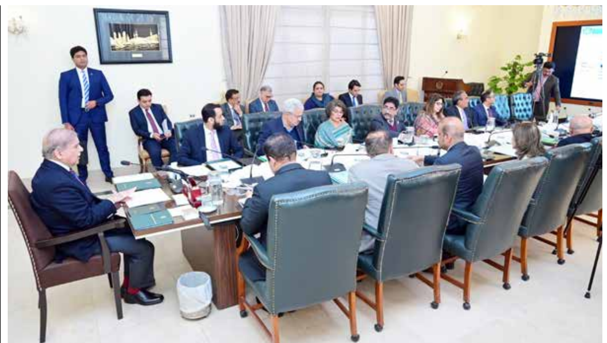
ISLAMABAD: Prime Minister Muhammad Shehbaz Sharif chairs a meeting regarding measures taken against human trafficking.