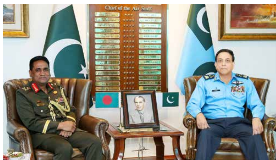
and Bangladeshi defence delegation signifies a resolute commitment to reinforce military partnership, fostering collaboration and promoting robust relations between the two countries.