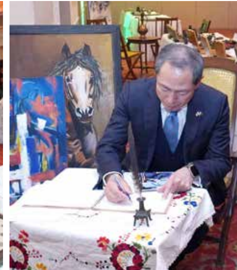
Ambassador of Japan pens down his comments