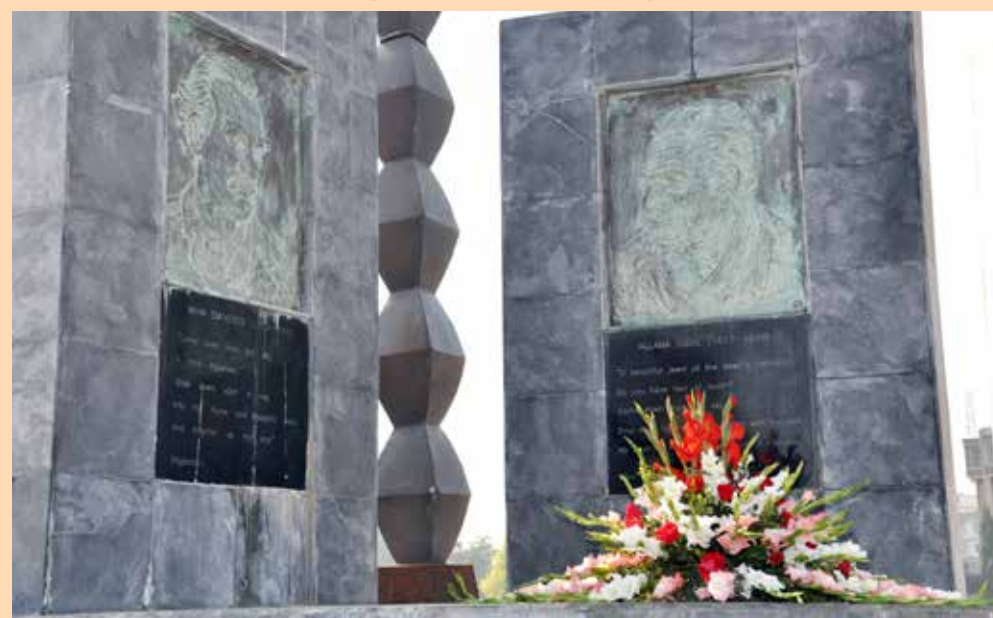
ISLAMABAD: A view of the original image of the monument, which unfortunately is not in the same shape anymore.

commitment and efforts to restore this unique monument celebrating our national poets, Mihai Eminescu and Allama Iqbal, as well as the enduring friendship between our nations."