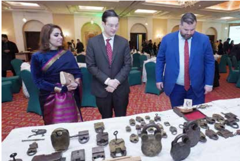
Ambassador of Romania takes interest in antique items