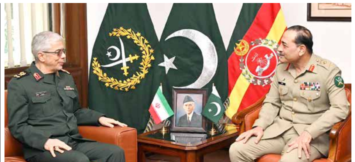
RAWALPINDI: Major General Mohammad Bagheri, Chief of General Staff (CGS) of the Iranian Armed Forces, visits the General Headquarters (GHQ) and calls on General Syed Asim Munir, NI (M), Chief of Army Staff (COAS).