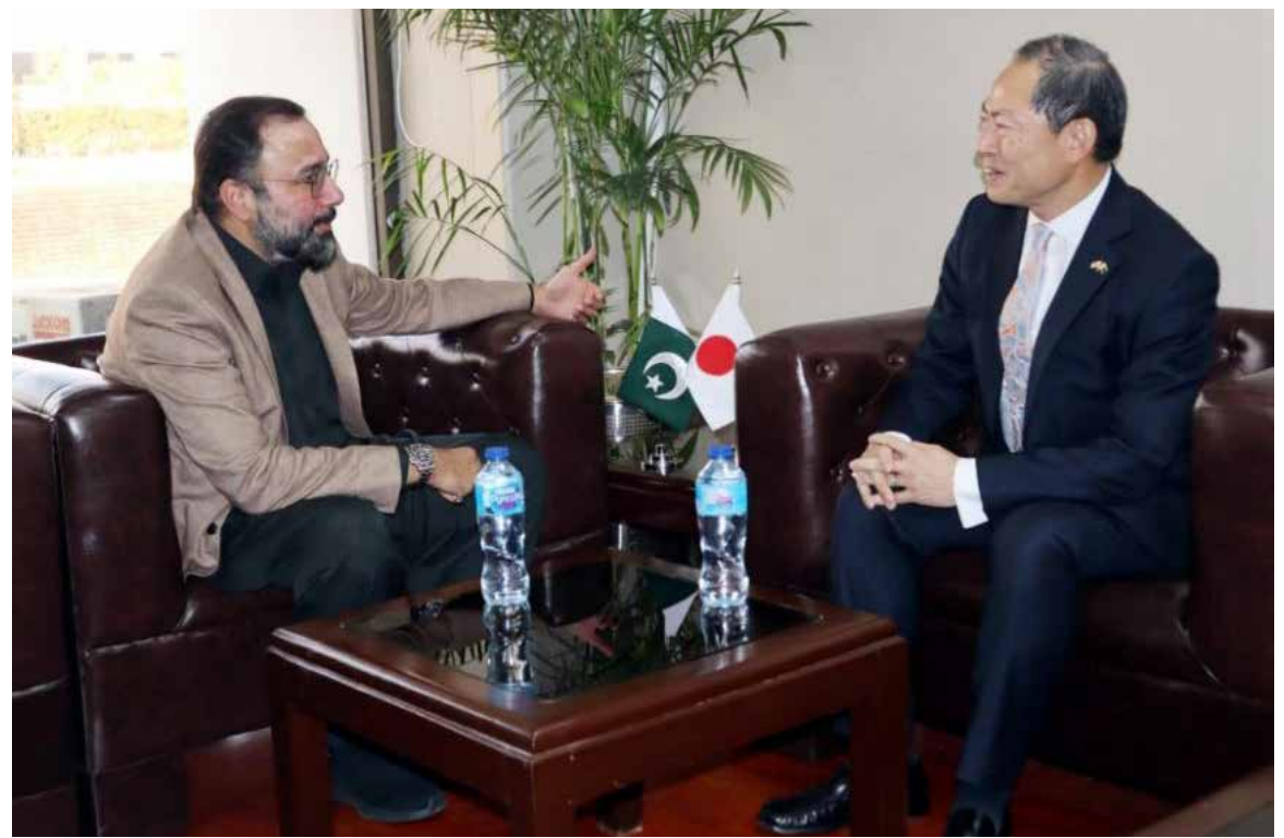
ISLAMABAD: Federal Minister for Overseas Pakistanis and Human Resource Development, Chaudhry Salik Hussain in a meeting with Japanese Ambassador to Pakistan H.E. Akamatsu Shuichi.

these gaps, ensuring that vulnerable countries have the tools and resources needed to mitigate climate risks and build climate resilience", she stated. Deputy Speaker Nathaniel Oyete Pierino expressed great interest in the SDGs and conveyed South Sudan's commitment to achieving sustainable development. He noted that South Sudan, as one of the world's youngest nations, is keen to learn from the experiences of other nations in implementing the SDGs, particularly in areas like climate action and environmental sustainable infrastructure. The meeting also highlighted the importance of South-South cooperation and the sharing of best practices, especially in the context of climate adaptation and mitigation strategies. Romina Khurshid Alam assured the delegation that Pakistan remains committed to supporting its partners in Africa and beyond.