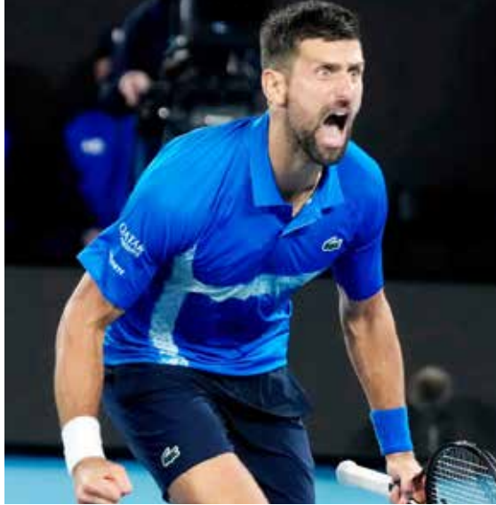
Alexander Zverev on Friday. For so many years, Djokovic has defied the ageing process with his endurance and dexterity. This was the latest example - at a time when few had predicted it. Time, it seemed, had eventually started to catch up with a player who is aiming to become the oldest Grand Slam men's singles champion in history. Last year was the first since 2017 - and