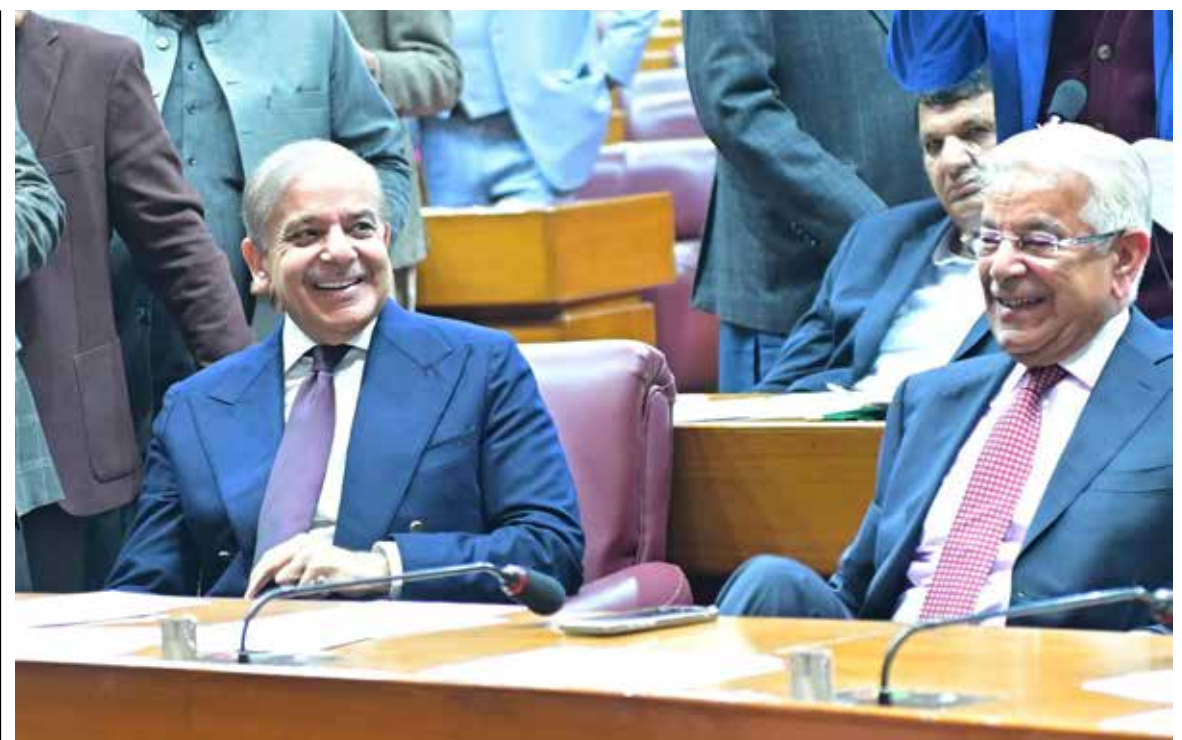
ISLAMABAD: Prime Minister Shehbaz Sharif attends National Assembly Session.