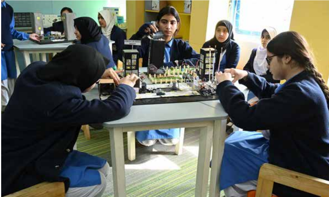
ISLAMABAD: January 21-A student works on building robots during a lab session, demonstrating innovative skills at ICG in the federal capital.