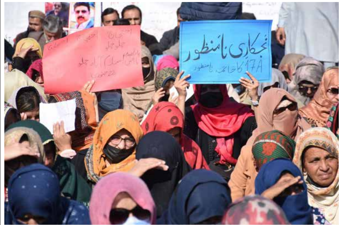
ISLAMABAD: A large number of the activists of All Government Employees Grand Alliance (Federal) holds placards during protest in the favor of their demands at Constitution Avenue in Federal Capital.