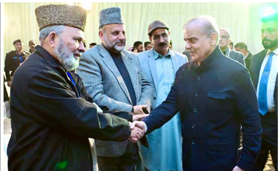
BHIMBER: Prime Minister Muhammad Shehbaz Sharif meets with Hurriyat Leaders on the occasion of founding ceremony of Daanish School.