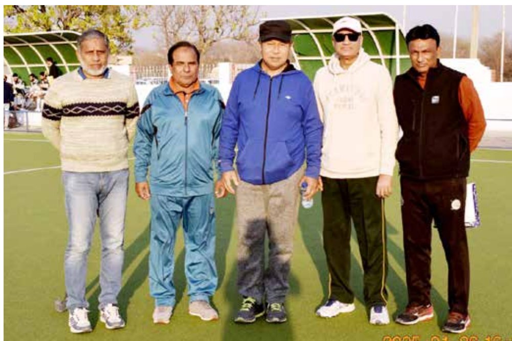
ISLAMABAD: Team Management of the Rising Stars Hockey Club with the High Commissioner of Brunei.