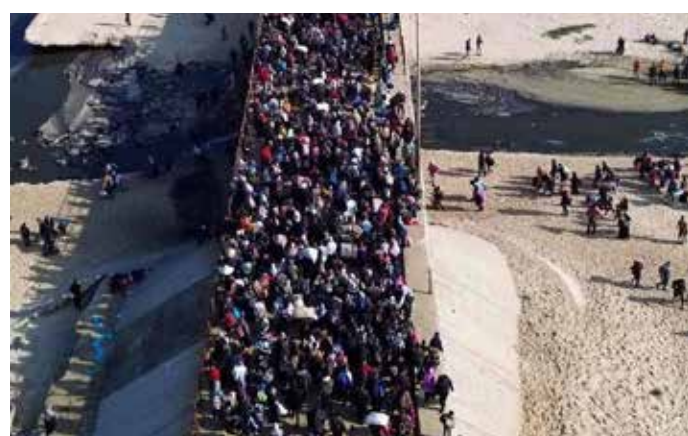
GAZA: Hundred of thousand Palestinians returning to north Gaza after breakthrough on hostages.

CAIRO: The Arab League on Sunday warned against "attempts to uproot the Palestinian people from their land," after US President Donald Trump suggested a plan to "clean out" the Gaza Strip and move its population to Egypt and Jordan. "The forced displacement and eviction of people from their land can only be called ethnic cleansing," the regional bloc's general secretariat said in a statement. "Attempts to uproot the Palestinian people from their land, whether by displacement, annexation or settlement expansion, have been proven to fail in the past," the statement added. Earlier Sunday, Egypt vehemently expressed its objection to Trump's suggestion. Cairo's