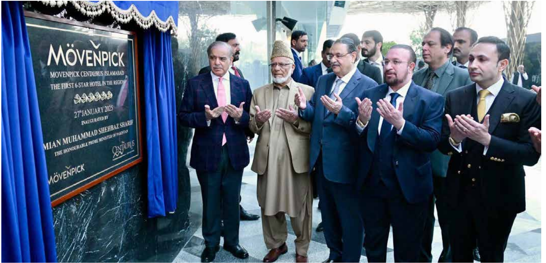
ISLAMABAD: Prime Minister Muhammad Shehbaz Sharif inaugurating an International Hotel.