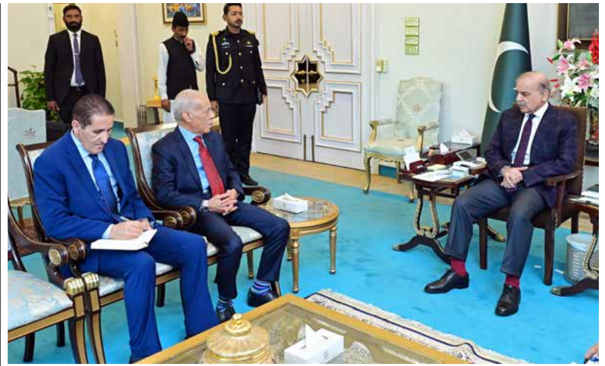
ISLAMABAD: Ambassador of the Kingdom of Morocco Amb. Mohamed Karmoune calls on Prime Minister Muhammad Shehbaz Sharif.