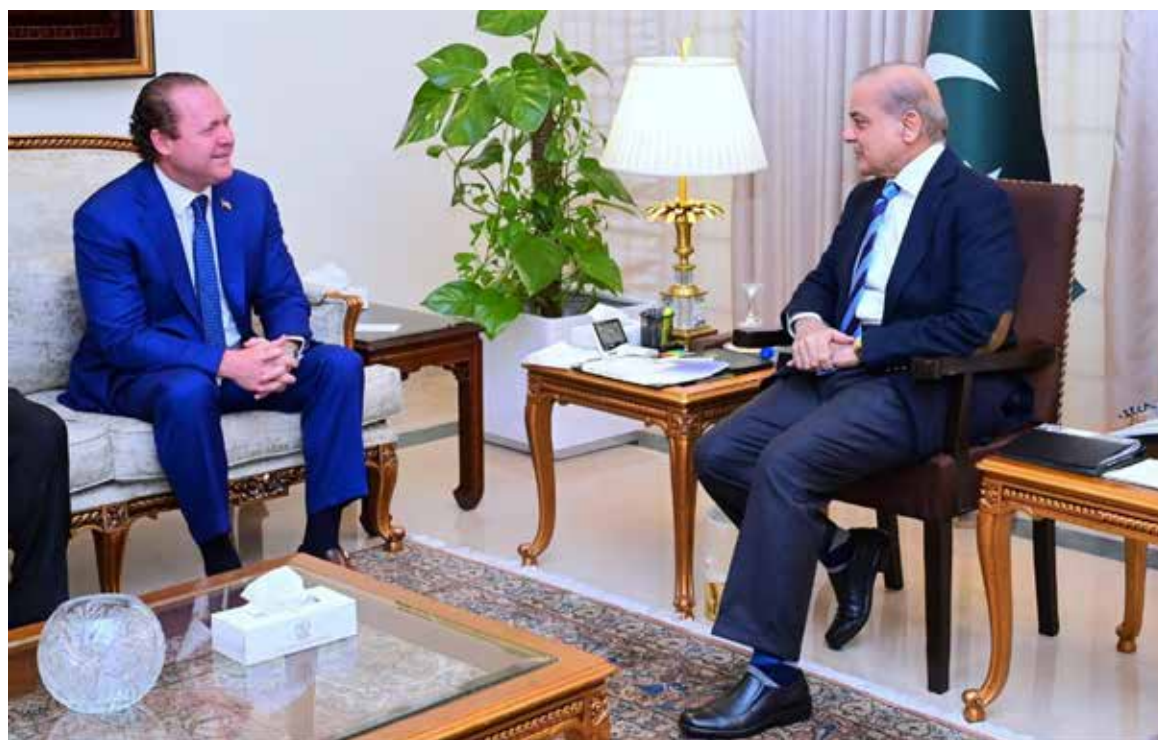
ISLAMABAD: A leading US Investor Gentry Beach calls on Prime Minister Shehbaz Sharif.