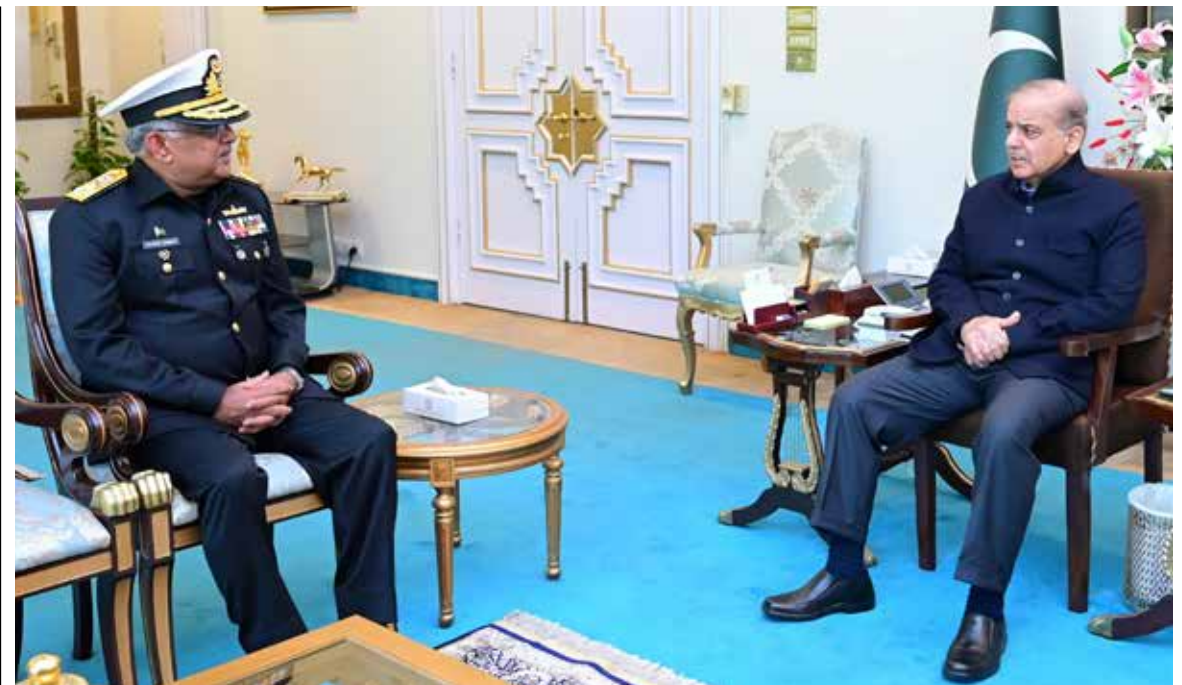
ISLAMABAD: Chief of Naval Staff Admiral Naveed Ashraf called on Prime Minister Muhammad Shehbaz Sharif in Islamabad.