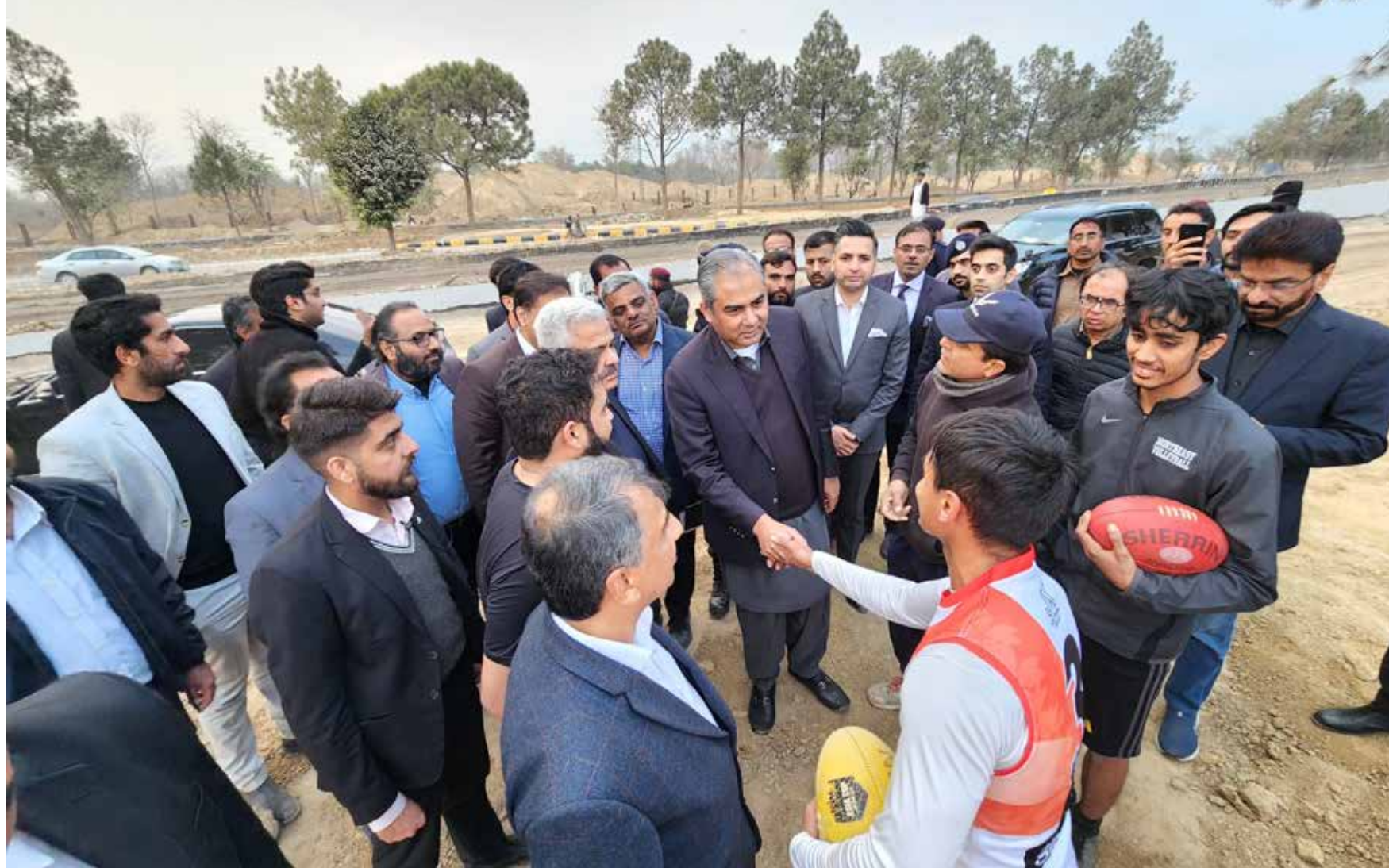
ISLAMABAD: Federal Minister for Interior Mohsin Naqvi visiting F-8 Exchange Chowk Interchange Project.