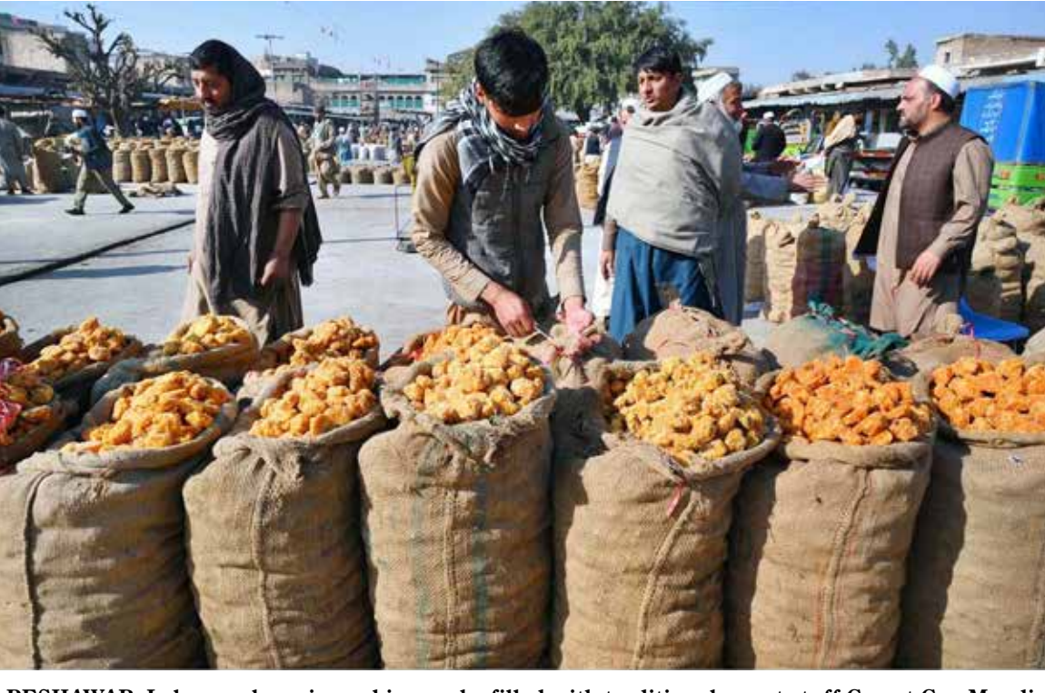
PESHAWAR: Labourer busy in packing sacks filled with traditional sweet stuff Gur at Gur Mandi.