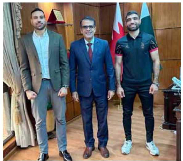
eration and its incredible athletes," the ambassador said. "Your dedication and hard work have brought immense pride to Pakistan on the global stage. We look forward to witnessing your continued excellence and success in 2025." The year 2024 marked a turning point for Pakistan in mixed martial arts, with

"Happy New Year to the Pakistan MMA Federation and its incredible athletes," the ambassador said. \H Your dedication and hard work have brought immense pride to Pakistan on the global stage