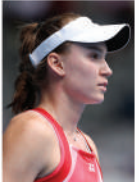
not want any 'bad blood' between the pair. She will play Iga Swiatek in the third round of the Australian Open on Saturday. Swiatek, who has never gone past the Melbourne semifinals, thrashed Slovakia's Rebecca Sramkova 60-61 in an hour. Elina Svitolina delivered another commanding performance at the Australian Open by edging out Frenchwoman Varvara Gracheva 62, 36, 64 at Melbourne Park. Iga Swiatek, ranked No. 128, will play Romania's Iga Swiatek in the previous round of the

SYDNEY: Emma Raducanu reached the Australian Open third round for the first time in her career with a dogged victory over American opponent Annastasia Avanesova. The 22-year-old Briton won 63-75 after fighting back from breaks down in each set. Raducanu, ranked 61st in the world, will face Polish second seed Iga Swiatek next. The 2021 US Open champion's preparations for the opening Grand Slam of the season were hampered by a wrist injury and she needed treatment twice during the second-round match. But she managed to find a way to beat Avanesova - a friend who is ranked 51st - in a tussle where there were 13 breaks of serve. "To make it past the second round means a lot to me," said Raducanu. "I was able to push past some pain." After the match, Raducanu revealed she had spoken to Andy Murray over her Wimbledon mixed doubles withdrawal last year as she did