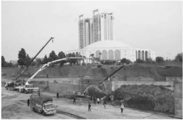
ISLAMABAD-Jan16: Laborers are busy in their concern working during the construction project of Serena Interchange in Federal Capital.