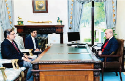
ISLAMABAD: Former Federal Minister and senior PPP leader Qamar Zaman Kaira meets Prime Minister Shehbaz Sharif, at the PM office on Thursday.