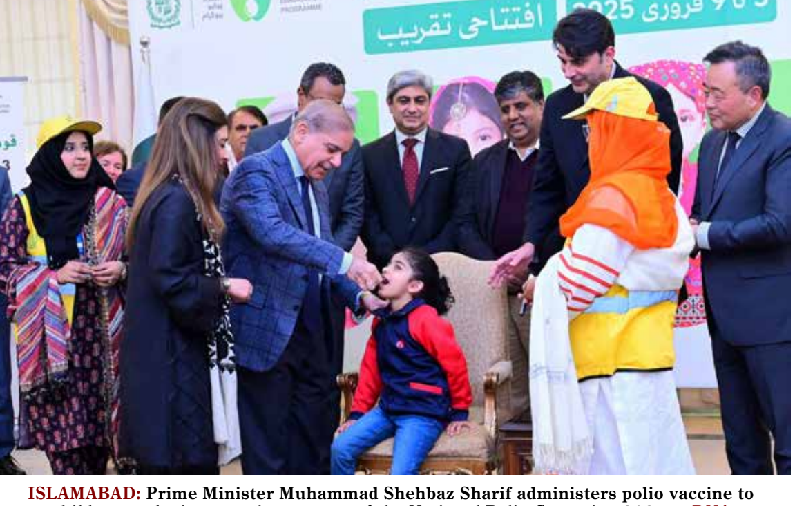
children at the inaugural ceremony of the National Polio Campaign 2025. - DNA