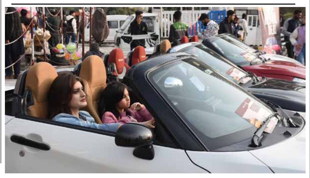
ISLAMABAD: Families are enjoying sports cars and bikes during "Centaurus Automotive Show 2025" in Federal Capital.

to provide assistance to the tourists. Despite the disruptions caused by the snowfall, the tourists seemed to be enjoying themselves, with many of them taking part in snowball fights, building snowmen and taking selfies with the snow-clad scenery providing a picturesque backdrop. "It's a wonderful experience," said a tourist from Lahore. "The snowfall has added to the beauty of the area, and we are enjoying every moment of it." "The overall atmosphere in the area remained festive, with the tourists and locals alike seeming to enjoy the winter Galyat and Leepa Valley had been transformed