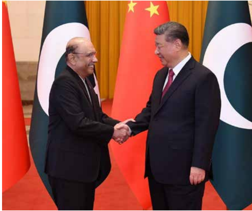
BEIJING: President Asif Ali Zardari being welcomed by the Chinese President Xi Jinping upon his arrival at the Great Hall of the People.