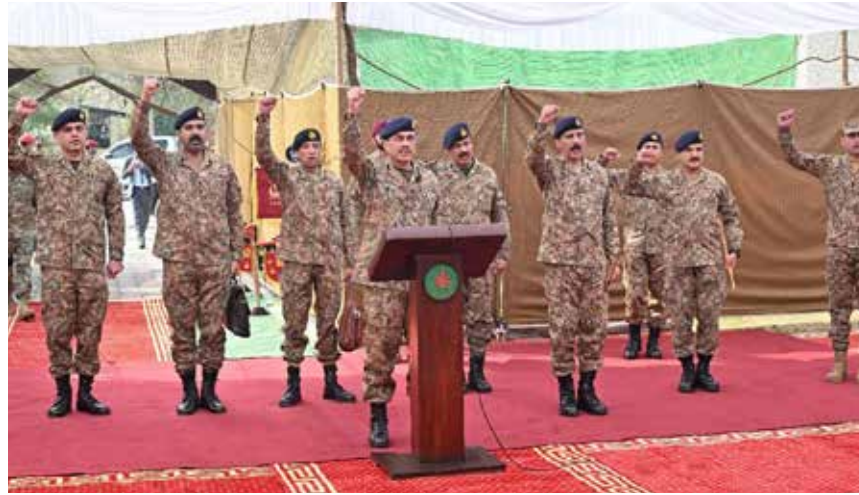
combat readiness of the deployed officers and soldiers in the face of challenging operational conditions in Kashmir.

RAWALPINDI: Chief of Army Staff (COAS) General Syed Asim Munir on Wednesday vowed that no act of aggression would go unanswered and underscored Pakistan Army's commitment to defend the nation's sovereignty and territorial integrity with full resolve. The army chief's remarks came as he visited Azad Jammu and Kashmir's (AJK) capital Muzaffarabad, where he paid homage to the sacrifices of the martyrs, a statement from the Inter-Services Public Relations (ISPR) said. Upon arrival at the Jammu and Kashmir Monument, the ISPR mentioned, he laid a floral wreath at the Martyrs' Monument and offered rich tributes to the unparalleled sacrifices of the Shuhada. While paying homage to the martyrs of Kashmir, the COAS also commended the unwavering dedication, professional excellence, and