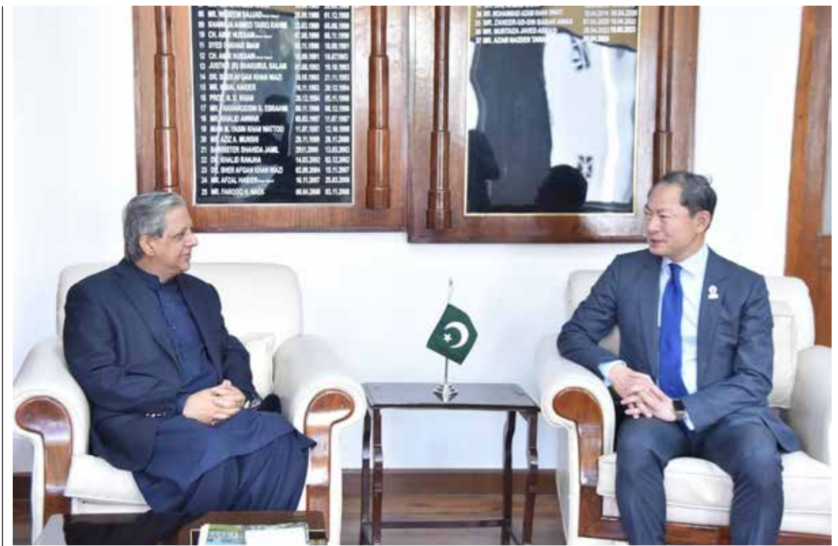
ISLAMABAD: Japanese Ambassador Akamatsu Shuichi called on Federal Minister for Law and Justice Senator Azam Nazeer Tarar.