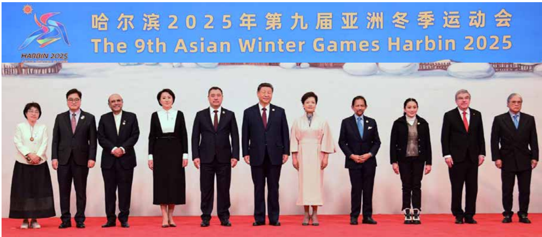
HARBIN: President Asif Ali Zardari in a group photo with the Heads of States/Governments attending the Opening Ceremony of the 9th Asian Winter Games 2025.