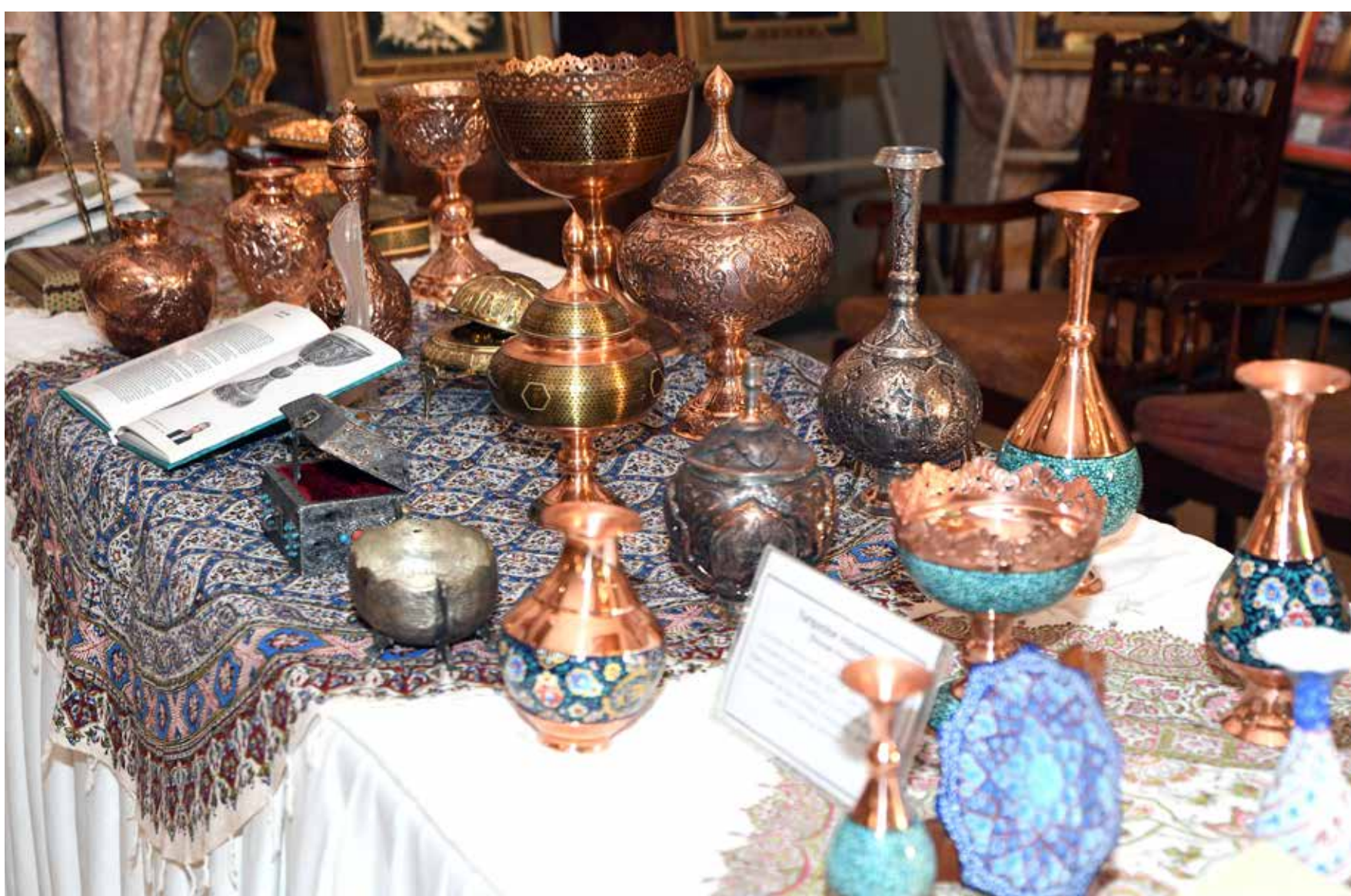
ISLAMABAD: Piece of art displayed on the occasion of the National Day of Iran held at Islamabad Serena Hotel.