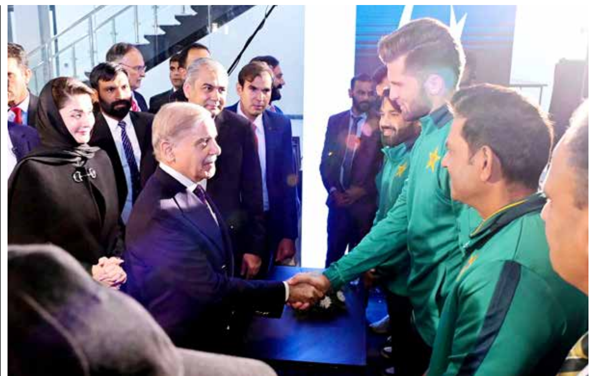
LAHORE: Prime Minister Muhammad Shehbaz Sharif meets the Pakistan Cricket Team players at the inauguration of the renovated Qaddafi Stadium in Lahore.