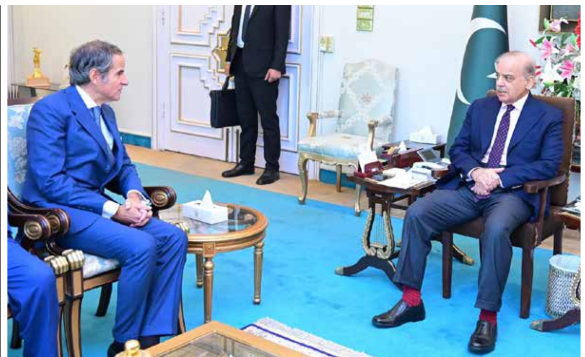
ISLAMABAD: Director General of International Atomic Energy Association Mr. Raphael Mariano Grossi calls on Prime Minister Shehbaz Sharif.