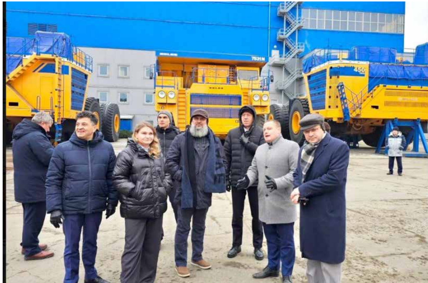
BELARUS: Federal Minister for Commerce Jam Kamal Khan visits BELAZ facility centre to explore industrial collaboration in mining, heavy machinery and infrastructure development.

Pakistani partners in the United Nations and shares positions on many topical issues on the international agenda, such as information security, prevention of an arms race in outer space, etc. He said that Russia welcomes Pakistan's willingness to become involved in the work of BRICS. At this stage, Pakistan's participation in the activities of the New Development Bank, which has proved to be an effective mechanism for financing infrastructure and sustainable development projects in BRICS and developing countries, looks promising, he said.