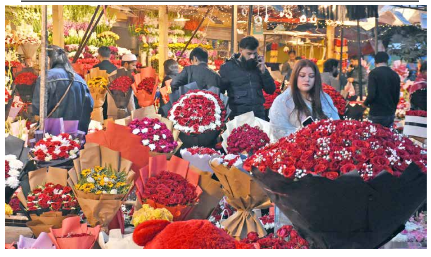
ISLAMABAD: A woman taking interest in beautiful red roses at F-6 Flowers Market as stuffed with different flowers in connection with Valentine Day in Federal Capital.