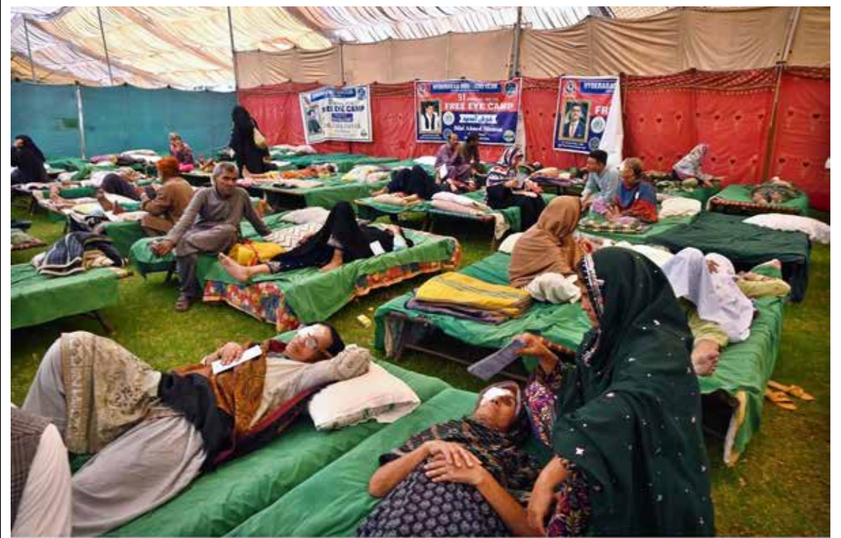
HYDERABAD: February 16 - An eye patient rests after undergoing surgery during a free eye camp organized by the Host Lions Club at Police Ground.