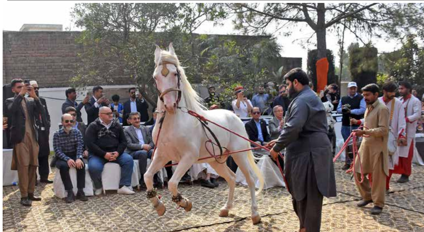
TAXILA: People watching a horse performs dance during Orange Festival at Karam Complex, organized by Dean of the Diplomatic Corps in collaboration with Chairman International Relation Committee, Islamabad High Court Bar Association.

sector, noting that collaboration with the private sector and international organizations could drive innovation and productivity. Iftikhar Ali Malik also underlined the vital role of education and training for farmers, equipping them with the necessary skills to adapt to modern agricultural practices. He said that prioritizing agriculture was not only an economic necessity but also a social imperative, as it impacts millions of livelihoods. By investing in agriculture, Pakistan can secure food, reduce poverty, and pave the way for sustainable development.—APP