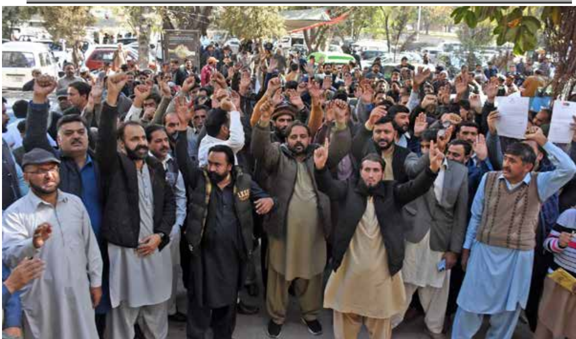
ISLAMABAD: A large number of the employees demonstrate protest outside Utility Store Head Office at Blue area as In a major move, the Utility Stores Corporation (USC) has initiated a large-scale restructuring, resulting in the termination of nearly 3,000 employees in a single day.