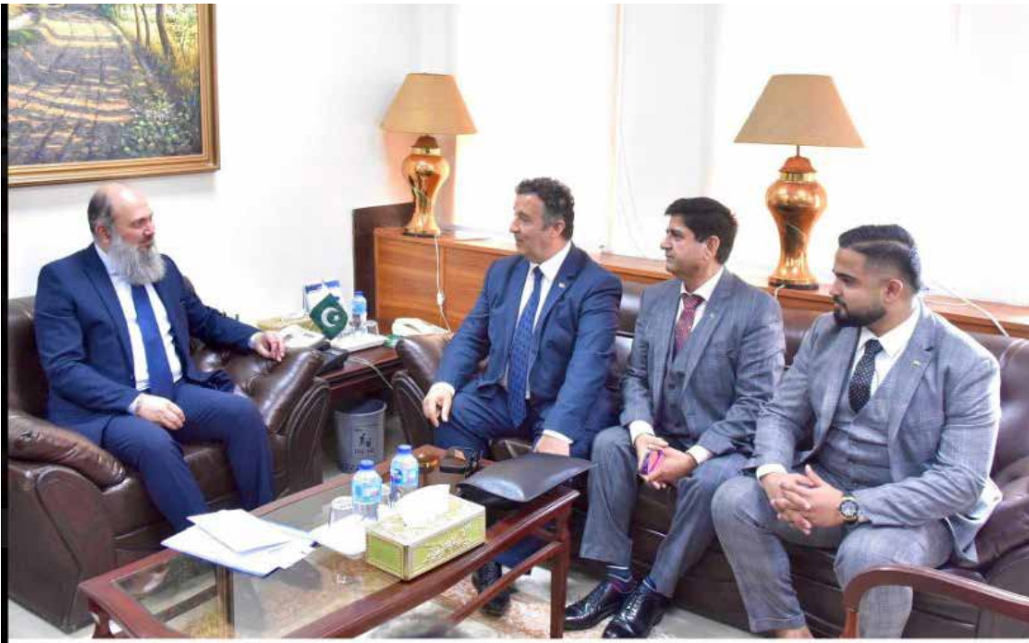
ISLAMABAD: Strengthening economic ties: Pakistan-Australia Business Council delegation calls on Commerce Minister Jam Kamal Khan.