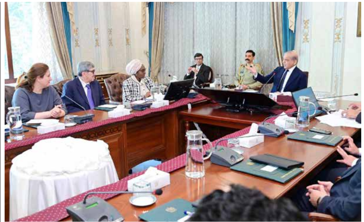
ISLAMABAD: A delegation of World Bank Executive Directors called on Prime Minister Muhammad Shehbaz Sharif.