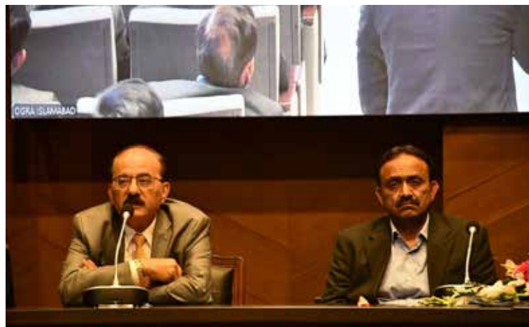
OGRA, Chief Engineer HDIP and the representatives of CNG sector have also shared their views.