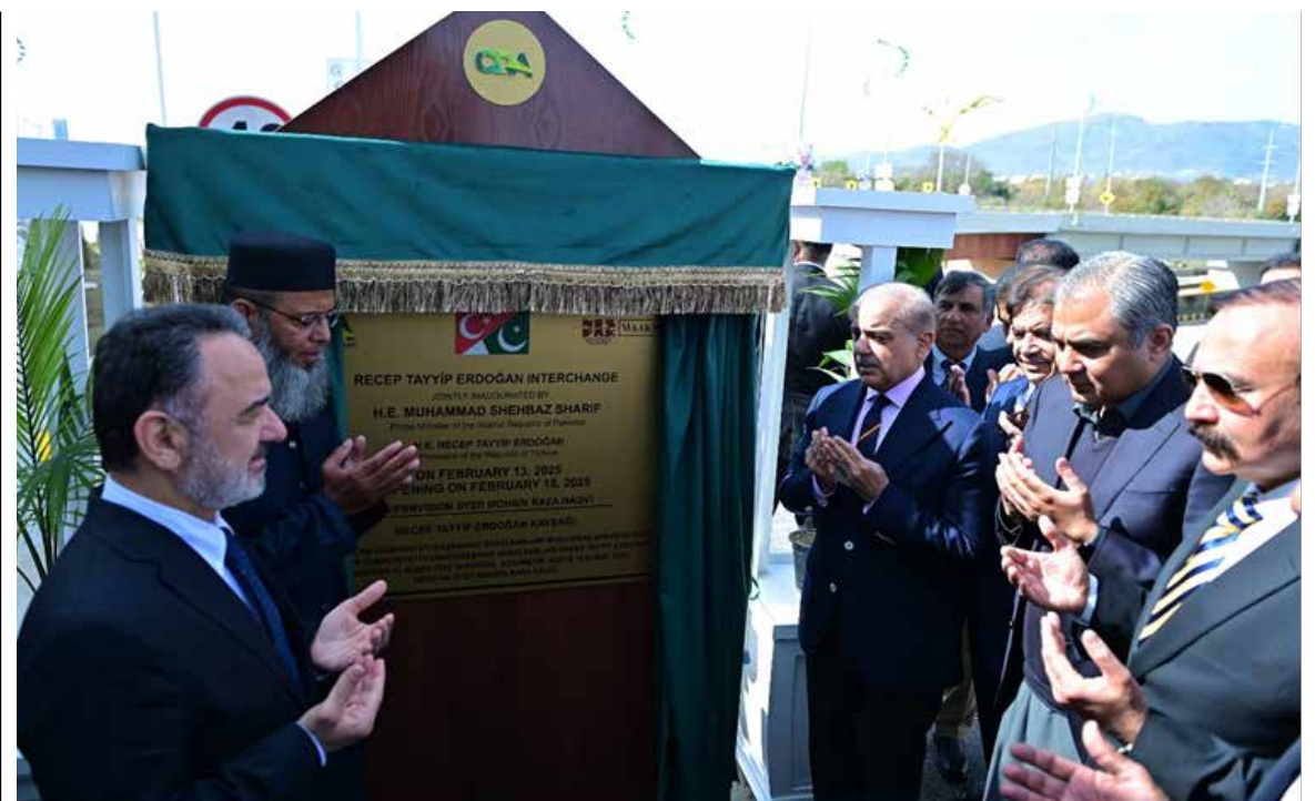
ISLAMABAD: Prime Minister Shehbaz Sharif and Turkiye Ambassador to Pakistan Irfan Naziroglu unveil the plaque of operationalization of Recep Tayyip Erdogan Interchange. – DNA