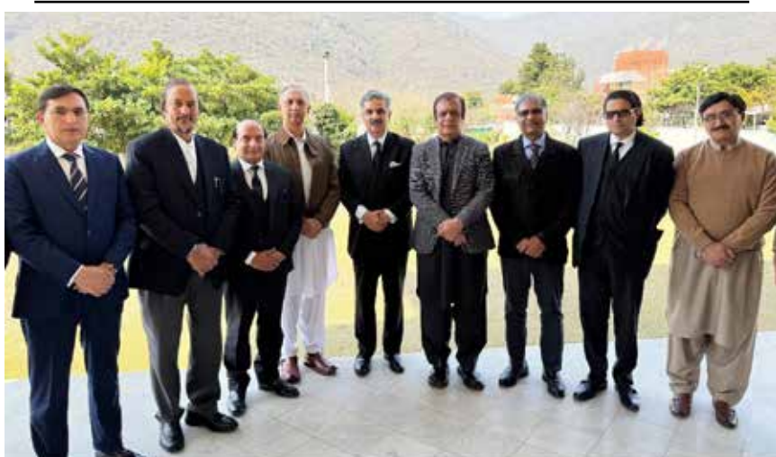
ISLAMABAD: Justice Yahya Afridi, Chief Justice of Pakistan in a group photo with the opposition leadership at Chief Justice House.