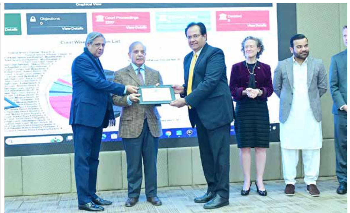
ISLAMABAD: Prime Minister Muhammad Shehbaz Sharif presents certificates of appreciation to the professionals who aided the development of Case Assignment and Management System.