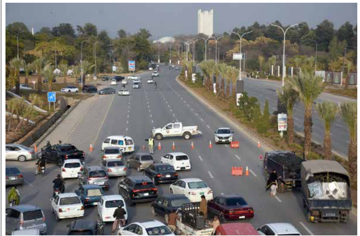
ISLAMABAD: Commuters stuck in traffic jams due to closed Srinagar Highway.