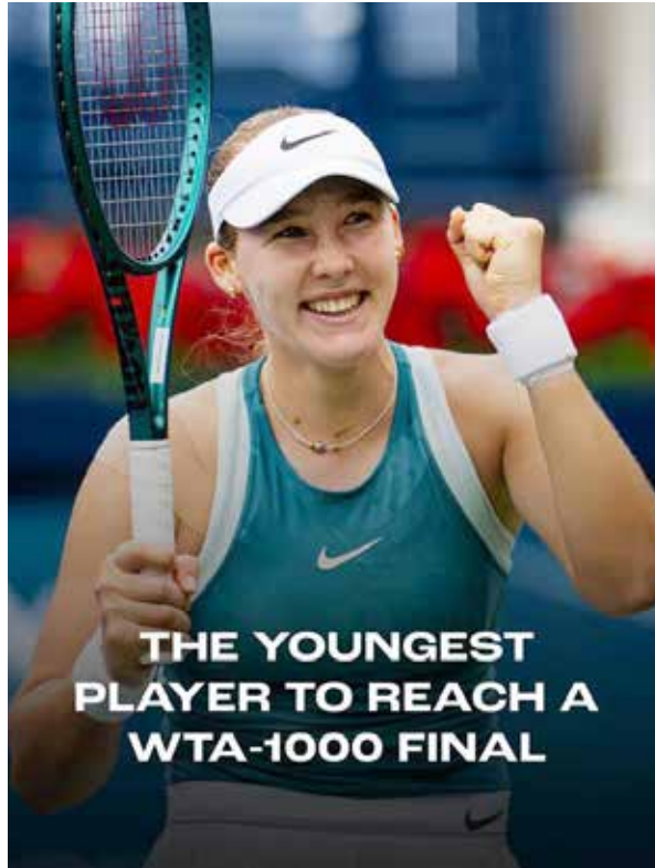
THE YOUNGEST PLAYER TO REACH A WTA-1000 FINAL