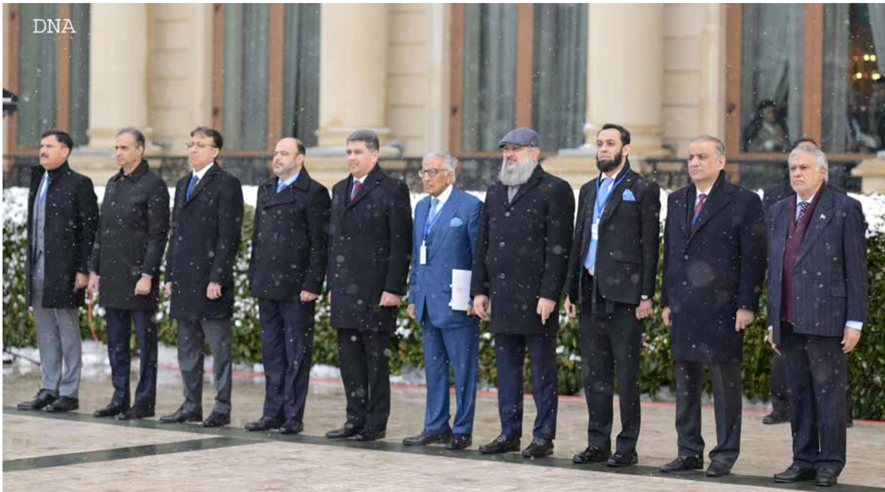
BAKU: Members of the federal cabinet and officers from the Pakistani delegation at the guard of honor for Prime Minister Muhammad Shehbaz Sharif at the Zugulba Presidential Palace on Monday.

ANKARA: Turkiye's foreign minister on Monday said Ankara backed a US initiative to end the Ukraine-Russia conflict but stressed that talks should involve both warring sides. Moscow and Washington have begun a direct dialogue in recent weeks, against a backdrop of rapprochement between new US President Donald Trump and Russian leader Vladimir Putin. "We attach great importance to the new US initiative as a result-oriented approach. We believe that a solution can be reached through negotiations in which both sides participate," Foreign Minister Hakan Fidan told a news conference with Russian counterpart Sergei Lavrov in Ankara. Lavrov's visit comes on the third anniversary of Russia's invasion of Ukraine and a week after Ukrainian President Volodymyr Zelensky traveled to the Turkish capital.