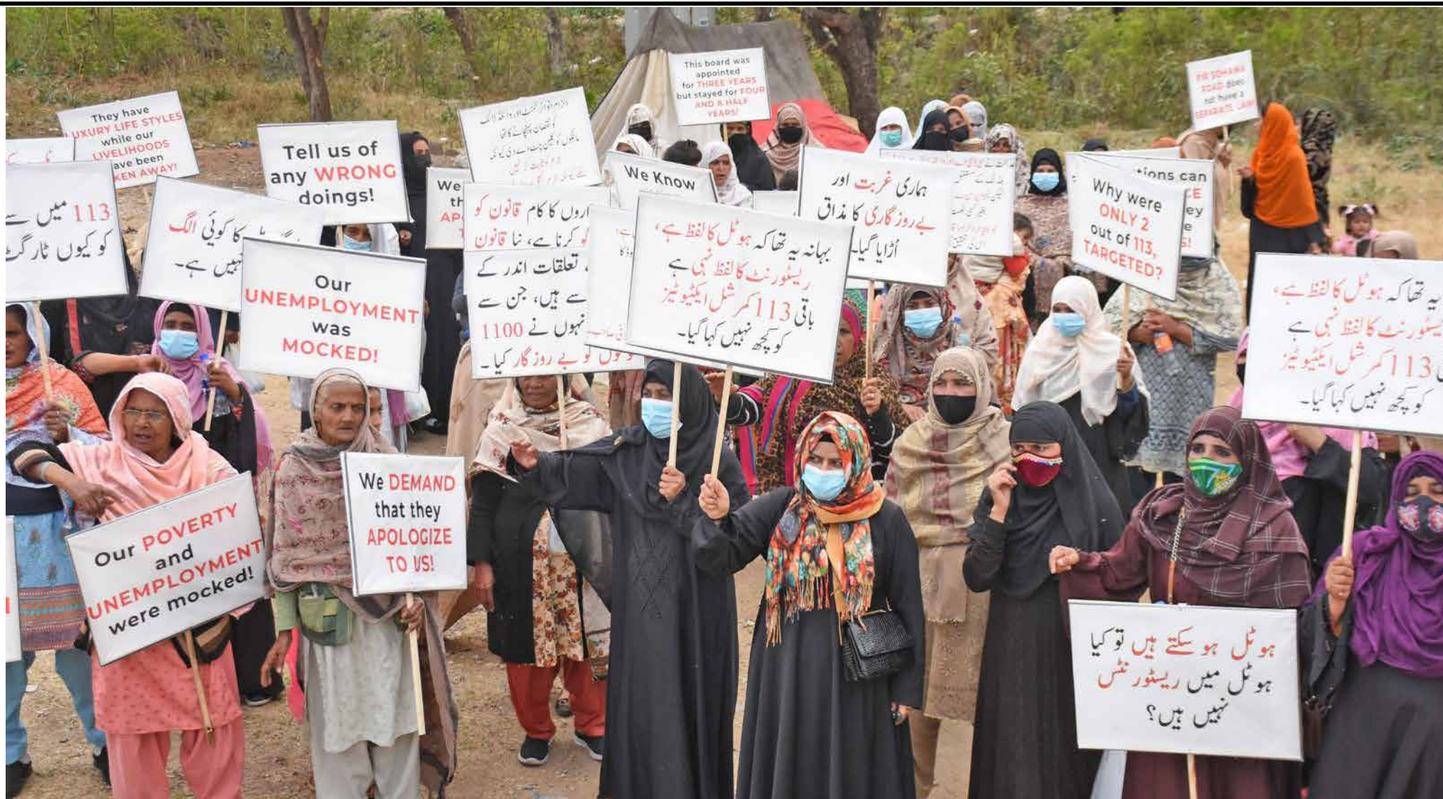
ISLAMABAD: Former Employees of Monal Restaurant holds placards and shouting slogans during protest in the favor of their demands outside National Press Club.