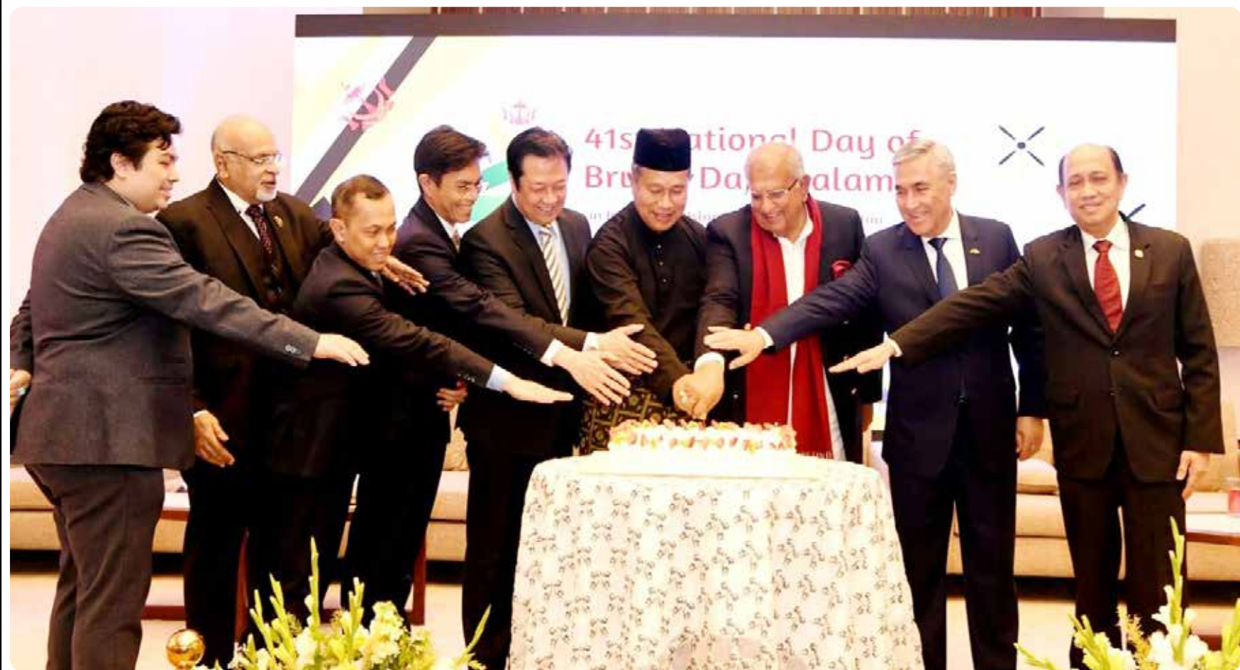
ISLAMABAD: Chief Guest Riaz Hussain Pirzada, Federal Minister for housing and works, High Commissioner of Brunei Darussalam Colonel @ Pengiran Hj Kamal Bashah Pengiran HJ Ahmad and others cutting cake to celebrate the 41st National Day of Brunei Darussalam. - DNA