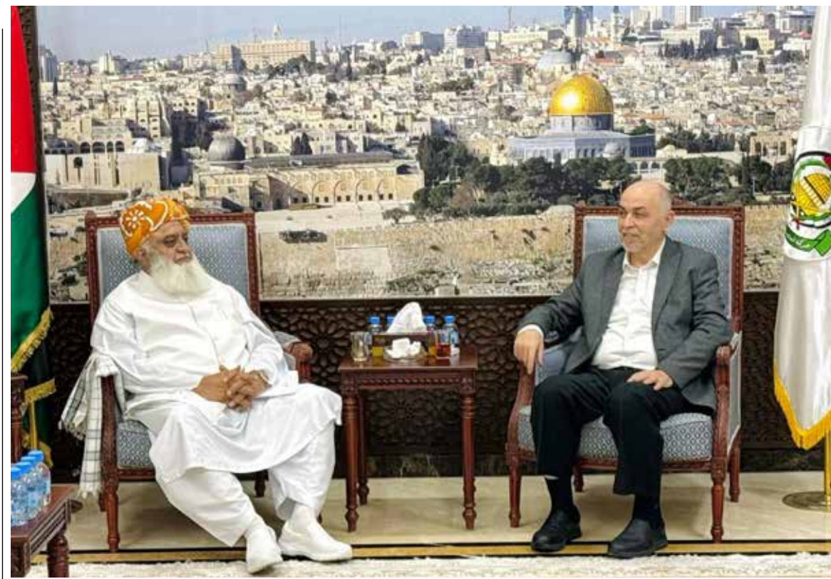
Doha: President of Jamiat Ulema-e-Islam Maulana Fazal-ur-Rehman meeting with Hamas leadership on Tuesday

TAIPEI: Taiwan detained a Chinese-crewed cargo ship on Tuesday after a subsea telecoms cable was severed off the island, the coast guard said. It is the latest in a series of Taiwanese undersea cable breakages, with previous incidents blamed on natural causes or Chinese ships. Taiwan's Chunghwa Telecom reported the cable between Penghu, a strategic island group in the sensitive Taiwan Strait, and Taiwan was disconnected early Tuesday, the Ministry of Digital Affairs said. The Togolese-registered ship Hongtai was intercepted in the area and escorted back to Taiwan, the coast guard said. The case was being "handled in accordance with national security-level principles," it added. "Whether the cause of the undersea cable breakage was intentional sabotage or a simple accident remains to be clarified by further investigation." The Hongtai, using a flag of convenience, was crewed by eight Chinese nationals and had Chinese funding, the coast guard said. Flags of convenience allow shipping companies to register their vessels in countries to which they have no link — for a fee and freedom from oversight. Beijing claims Taiwan as part of its territory and has threatened to use force to bring it under its control. And Taiwan fears China could sever its communication links as part of an attempt to seize the island or blockade it. "It cannot be ruled out that it was a grey zone intrusion by China," the coast guard said, referring to actions that fall short of an act of war.—APP