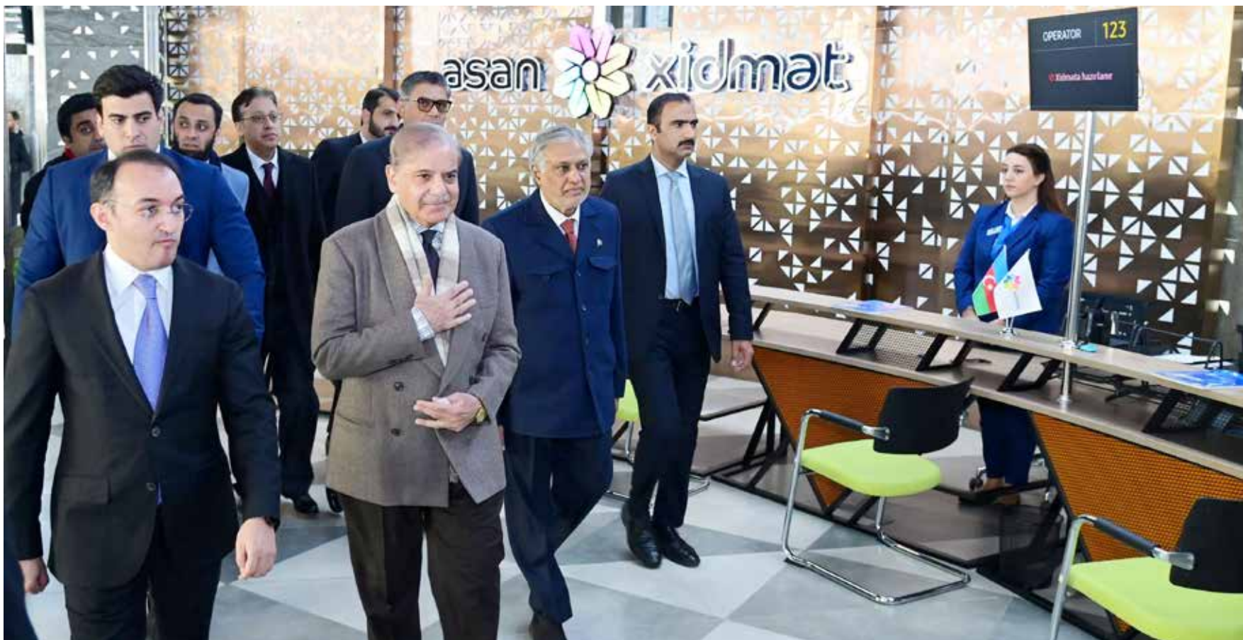
BAKU: Prime Minister Shehbaz Sharif meeting with volunteers during his visit to ASAN KHIDMAT center in Baku, Azerbaijan

LAHORE: Jamaat-e-Islami Emir Hafiz Naemur Rehman met with famous religious scholar Dr Zakir Naik. The scholar was not able to visit Mansoorah due to security concerns last October. He reached the Lahore Airport on Tuesday where he was welcomed by JI Emir. The Emir briefed the guest about the services provided by the JI - ranged from religious to educational activities. JI Emir said the JI was a champion of Islamic unity and a great proponent of respect for all beliefs and belief in humanity. He said the JI wanted to bring about a prosperous revolution so that the country become a welfare state in a true sense.