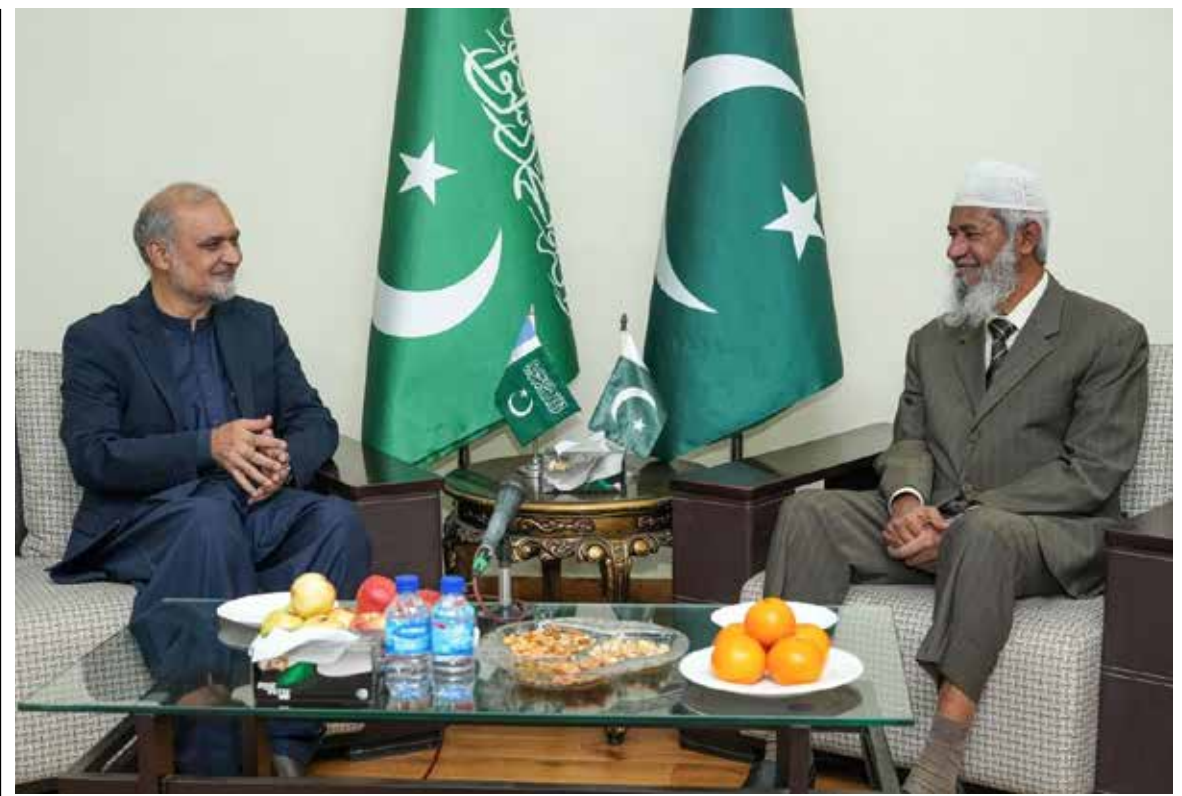
LAHORE: Renowned religious scholar Dr. Zakir Abdul Karim Naik met with Ameer of Jamaat-e-Islami Hafiz Naeem-ur-Rehman, at Mansoorah.

try. As a result of the home grown economic reforms, he said, extraordinary business, trade and investment opportunities were generated in the five major sectors including agriculture and agro processing, manufacturing, mining, tourism and ICT. The business community of the Islamic Republic