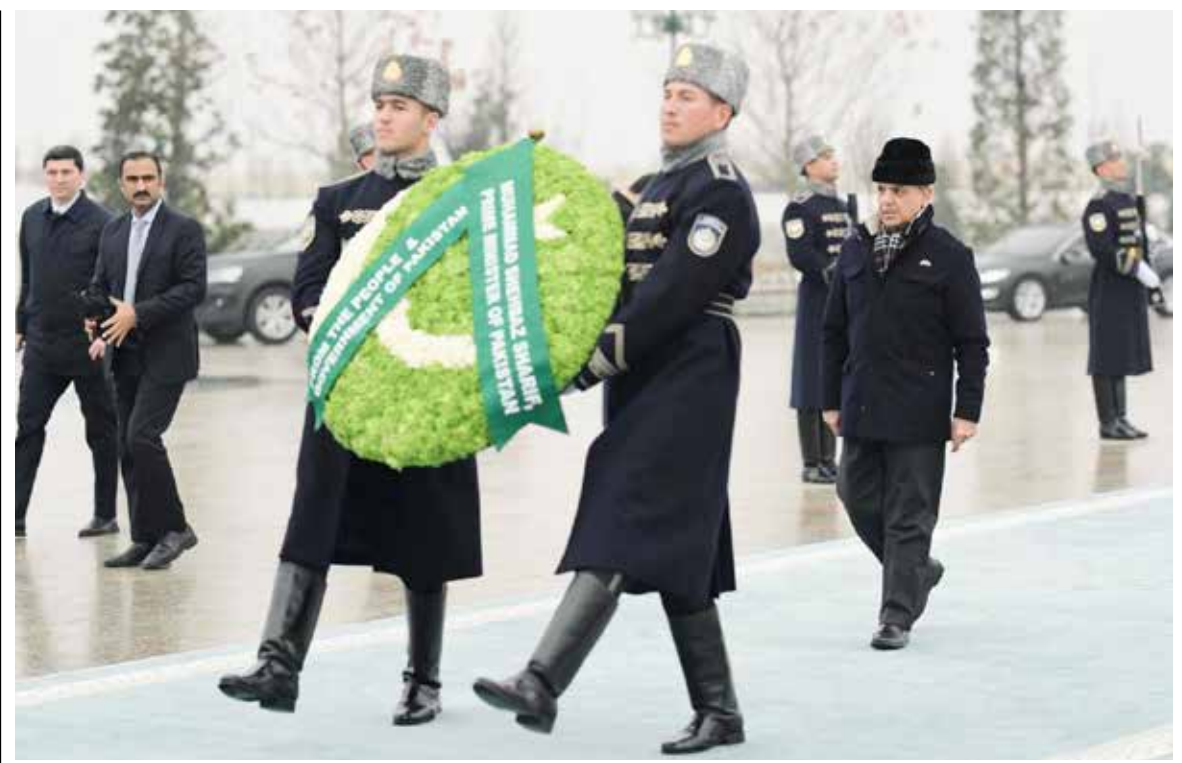
TASHKENT: Prime Minister Shehbaz Sharif laying a floral wreath at the Independence Monument in Tashkent.

ISLAMABAD: Pakistan and Iran have signed a memorandum of understanding (MoU), setting new bilateral trade targets and to remove the hurdles in the process. Iran also assured Pakistan of reducing business visa fees and facilitating trade activities. The MoU was signed during a high-level meeting between the Federation of Pakistan Chambers of Commerce and Industry and Iran's Mashhad Chamber of Commerce and Industry. During the meeting, both sides set a target to increase bilateral trade to $10 billion and signed an MoU to facilitate economic cooperation. The agreement aims to enhance trade, investment, and business collaboration between the two neighboring countries. The bilateral trade between Iran and Pakistan also witnessed an increase during the last fiscal year, reaching $2.8 billion.