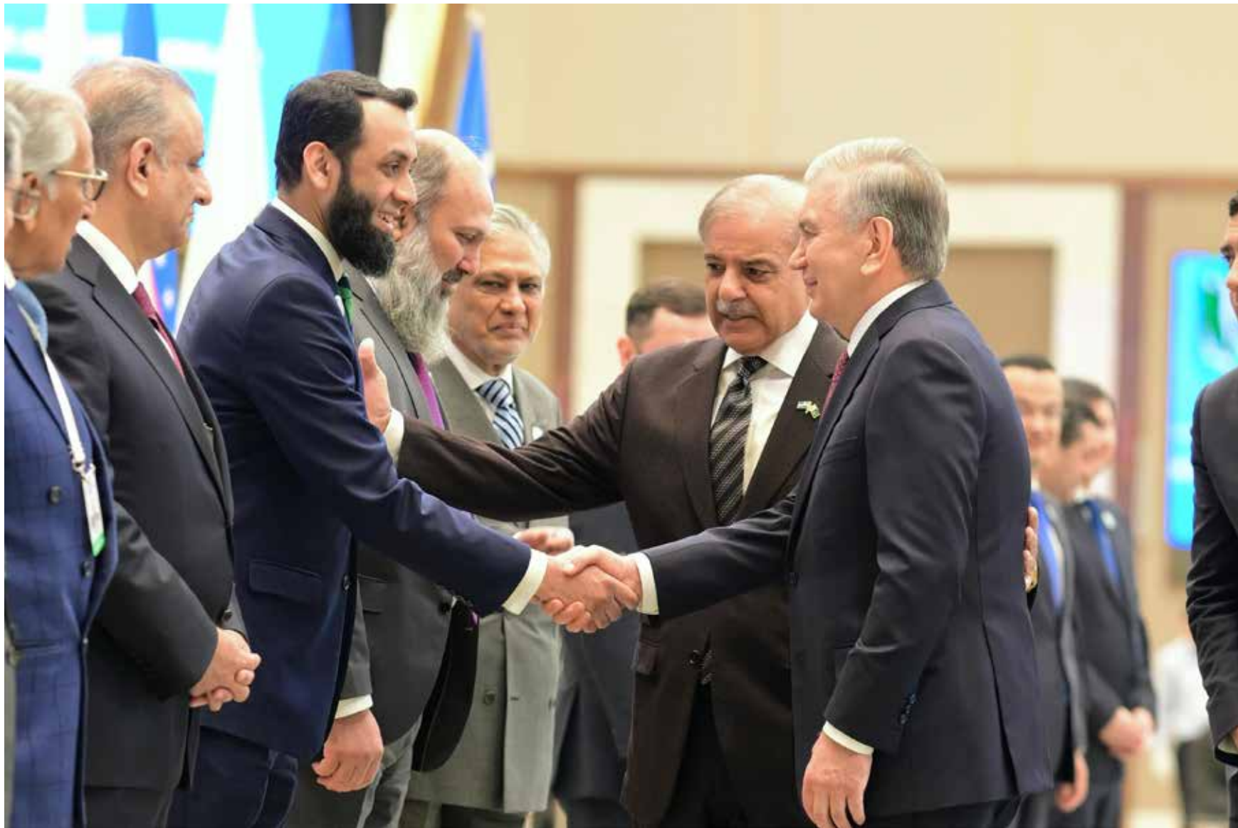
TASHKENT: Prime Minister Muhammad Shehbaz Sharif and President of Uzbekistan H.E. Shavkat Mirziyoyev introducing their respective delegations at the official welcoming ceremony held at Congress Centre Tashkent.—DNA

JAKARTA: Indonesia on Wednesday launched a campaign to raise $200 million in humanitarian aid for Palestinians, as Jakarta moves to support the rebuilding of Gaza. A staunch supporter of Palestine, the Indonesian government and people see Palestinian statehood as being mandated by their own constitution, which calls for the abolition of colonialism. The campaign, "Indonesia for Palestine: Solidarity, Real Action and New Hope," is being organized by the Indonesian Ulama Council, Indonesia's National Alms Agency and other NGOs with the support of the Ministry of Foreign Affairs. "We are starting this campaign with the initial target of $200 million," Deputy Foreign Minister Anis Matta said at the campaign launch in Jakarta.—APP