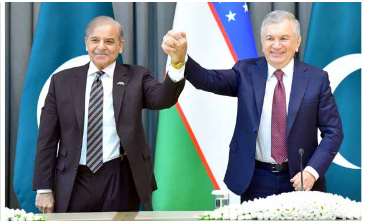
TASHKENT: Prime Minister Shehbaz Sharif and Uzbekistan's President Shavkat Mirziyoyev displayed a rare gesture of brotherhood as they held hands during a joint press stakeout.