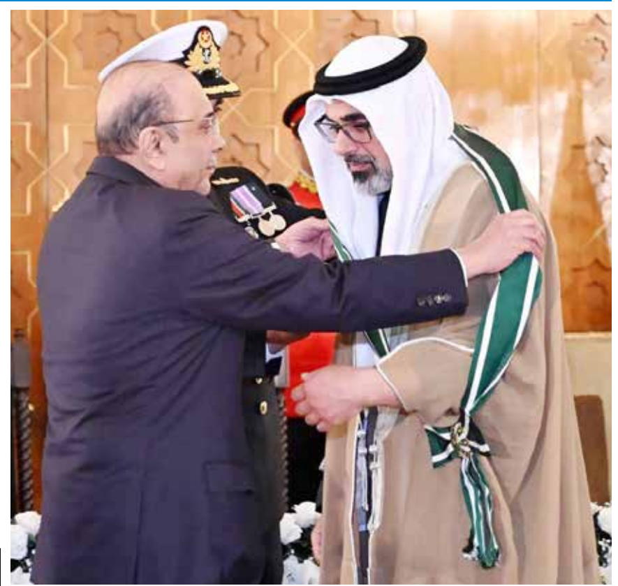
ISLAMABAD: President Asif Ali Zardari conferring the award of Nishan-i-Pakistan upon the Crown Prince of Abu Dhabi and Chairman of Abu Dhabi Executive Council, Sheikh Khaled bin Mohamed bin Zayed, at Aiwan-e-Sadr.