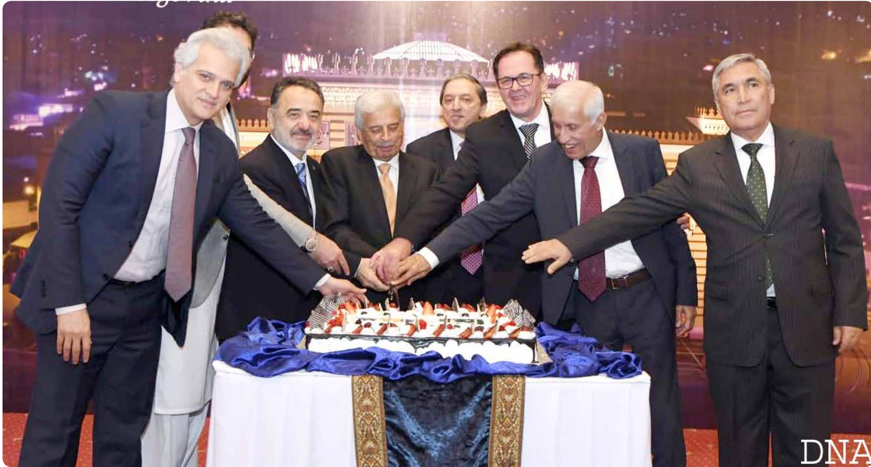
ISLAMABAD: Federal Minister for Industries Rana Tanvir Hussain, Federal Minister for Maritime Affairs Qaisar Shiekh, Ambassador of Bosnia and Herzegovina Emin Cohodarevic and others cutting cake to celebrate the Independence Day of Bosnia and Herzegovina, at Islamabad Serena Hotel. - DNA