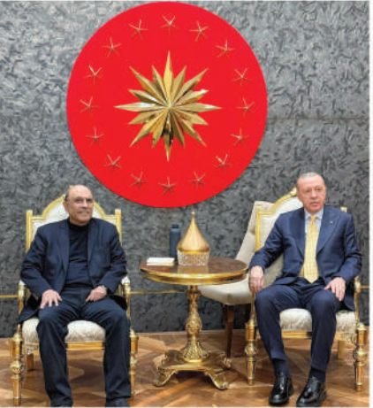
ISTANBUL: President Asif Ali Zardari meeting with the Turkish President Recep Tayyip Erdogan, during his brief stop-over in Istanbul.

BERLIN: German Chancellor Olaf Scholz described President Donald Trump's suggestion that the US could take ownership of the Gaza Strip, advocate its population and re-development it as a "scandal" in a pre-election debate Sunday. His main challenger also voiced unease but suggested there's "a lot of rhetoric" coming from Washington. The conservative Scholz and centrist challenger Friedrich Merz, the frontrunner in the Feb. 23 election, discussed top domestic issues such as Germany's struggling economy and migration, and also addressed foreign policy three weeks into Trump's new term. Asked what he made of Trump's proposal to redevelop Gaza into "the Silicon of the Middle East," Scholz replied: "A scandal. Besides that, a really terrible obligation," given the extent of the destruction that is now visible there.