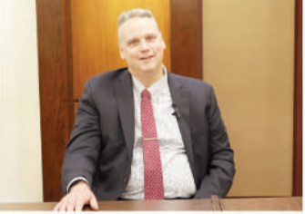
tries establish their eye banks. He underlined that our primary purpose is to prepare for the launch of local eye donation programs. Trained donation coordinators will identify, screen, consent to