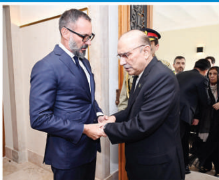
LISBON: President Asif Ali Zardari offering his condolences over the demise of Prince Karim Aga Khan with Prince Rahim Al-Hussaini Aga Khan.