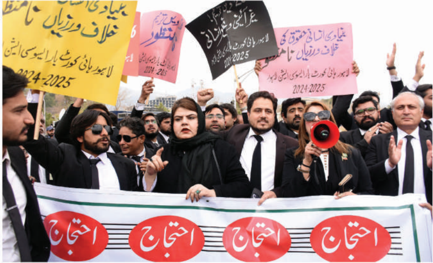
ISLAMABAD: Lawyers shouting slogans during protest in favour of their demands at D-Chowk, in Federal Capital.

NEW DELHI: The Pakistan High Commission in India hosted a "Pakistan Fest" in New Delhi showcasing the country's rich cultural heritage and diverse cuisine. The event, which drew attendees from different walks of life, featured the display of cultural artifacts, traditional clothing, and Pakistani food. The visitors relished Pakistani delicacies and evinced keen interest in the various items on display. In his remarks, Pakistan's Charge d'Affaires, Saad Ahmad Warraich said that the bursting colors of the festival and its delectable tastes and flavors were a testament to Pakistan's proud cultural and culinary traditions.—APP