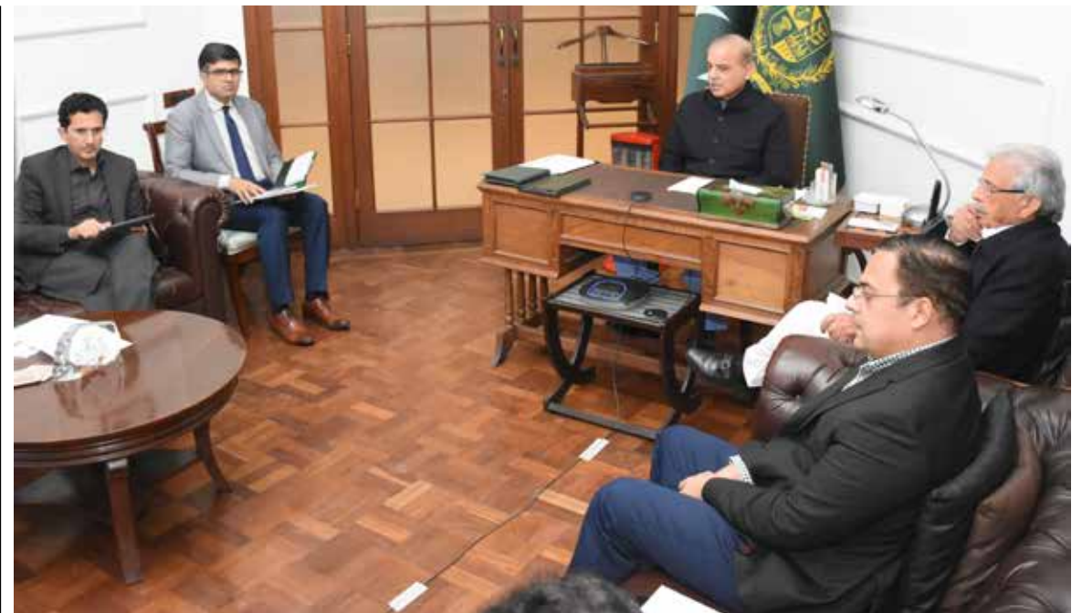
LAHORE: Prime Minister, Shehbaz Sharif chairs a meeting regarding sugar supply and price control in the country. Federal Minister for Economic Affairs Ahad Khan Cheema, Federal Minister for National Food Security Rana Tanveer Hussain, and relevant senior government officials also attended the meeting.