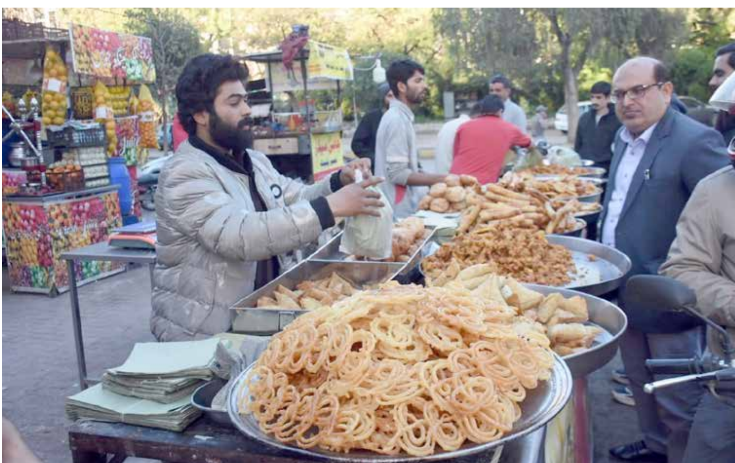
ISLAMABAD: People buy fritters for iftar during the Islamic holy fasting month of Ramadan, in the Federal Capital.