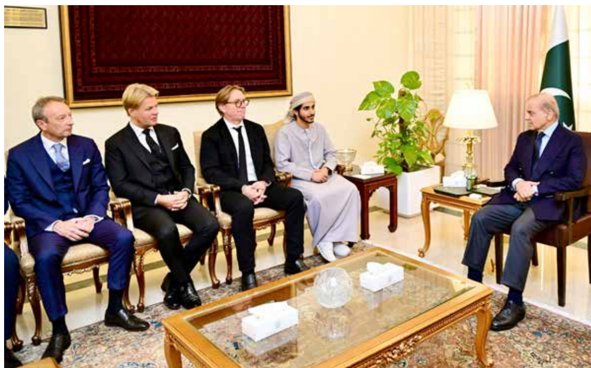
ISLAMABAD: A delegation of Aleria and International Free Zones Authority UAE calls on Prime Minister Muhammad Shehbaz Sharif.