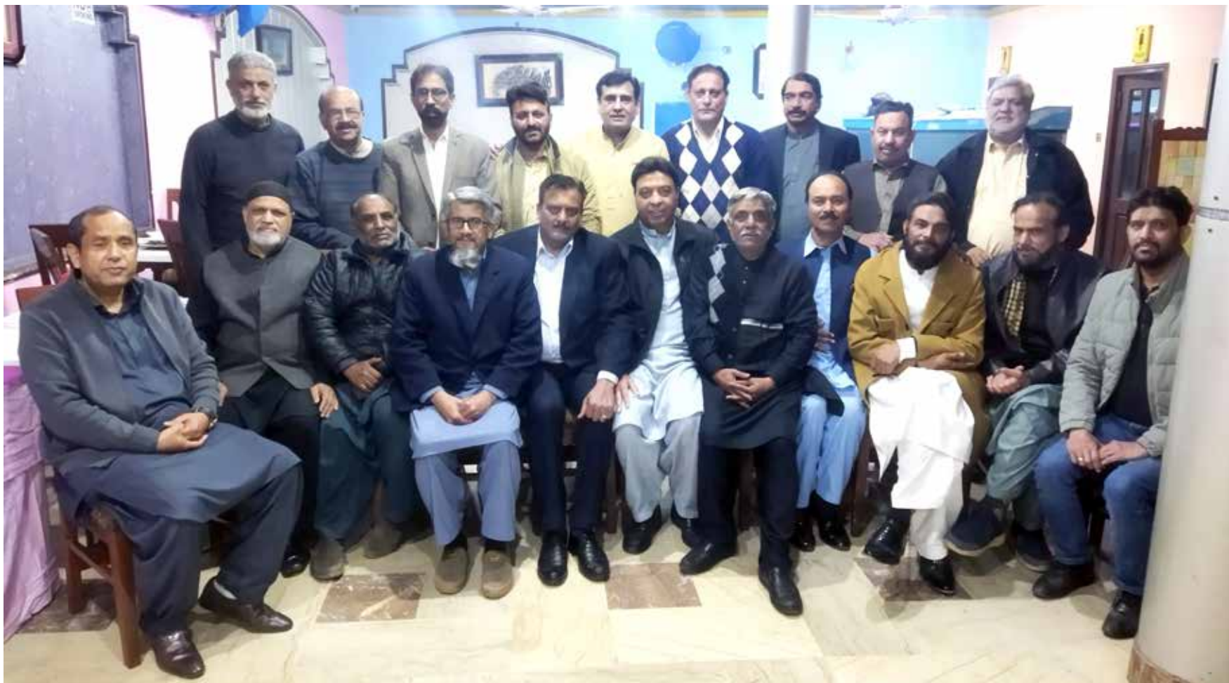
ISLAMABAD: Colleagues of Muslim High school No 2 Session 1983-84 arranged a get-together. They remained together for some time and refreshed memories of school days.

FROM PAGE 01 However, the situation was precarious due to the country's foreign policy, especially its Afghanistan policy, he claimed. Both Gandapur and Gohar have previously engaged in back-channel discussions and are now reportedly making renewed efforts to establish communication with the powers that be. The News reported quoting sources. However, within the PTI, there is growing recognition that this dual approach of seeking dialogue while attacking the establishment cannot work.