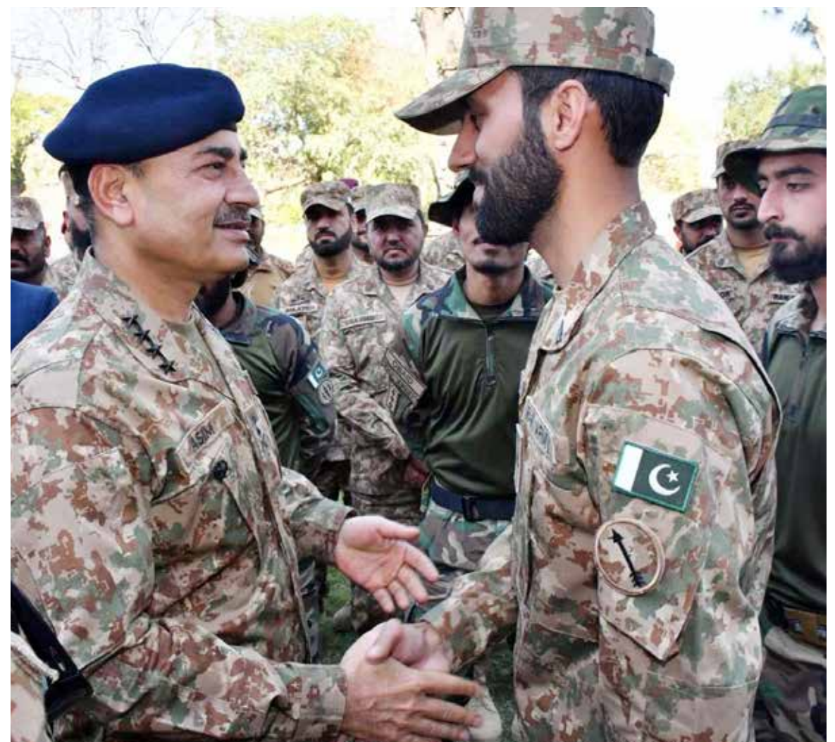
BANNU: General Asim Munir, Chief of Army Staff, shakes hands with soldiers during his visit to Bannu acknowledging their dedication, and boosting their morale.