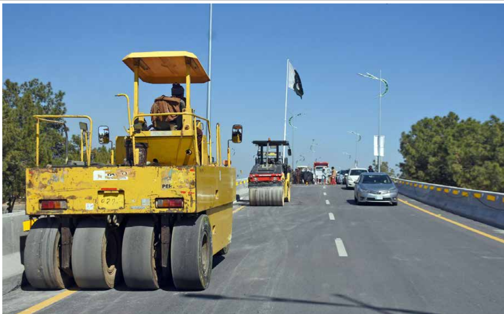
ISLAMABAD: Laborers filling the dig on newly constructed Recep Tayyip Erdogan Interchange, which occur only after first rain of its inauguration.

ISLAMABAD: The Rupee on Thursday appreciated by 05 paise against the US Dollar in the inter-bank trading and closed at Rs279.81 against the previous day's closing of Rs279.86. However, according to the Forex Association of Pakistan (FAP), the buying and selling rates of the dollar in the open market stood at Rs280.1 and Rs281.6, respectively. The price of the Euro increased by Rs3.73 to close at Rs302.07 against the last day's closing of Rs298.34, according to the State Bank of Pakistan (SBP). The Japanese yen went up by 01 paise and closed at Rs1.88, whereas an increase of Rs2.34 was witnessed in the exchange rate of the British Pound, which was traded at Rs361.03 as compared to the last day's closing of Rs358.69.