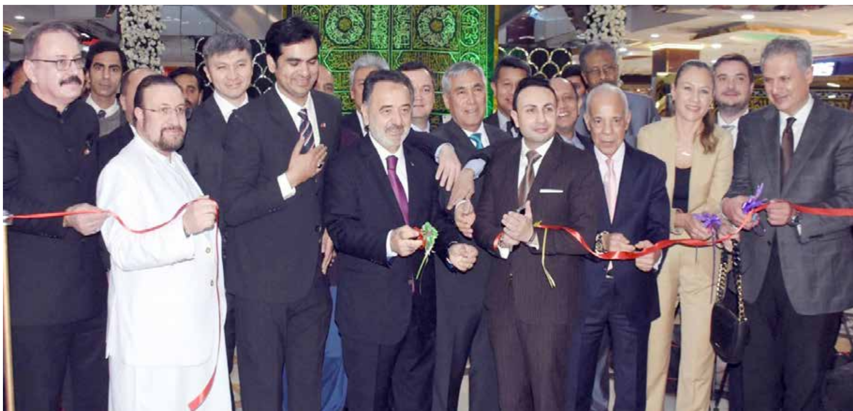
ISLAMABAD: Ambassador of Türkiye Irfan Naziroglu, Dean of Africa Group Mohammad Karmoune Ambassador of Morocco, Ambassadors of Jordan, Malaysia, TRNC and others cutting ribbon to inaugurate the solo exhibition at a local hotel.

ISLAMABAD: The Rupee on Friday depreciated by 15 paisa against the US Dollar in the interbank trading and closed at Rs279.96 against the previous day's closing of Rs279.81. However, according to the Forex Association of Pakistan (FAP), the buying and selling rates of the dollar in the open market stood at Rs280.25 and Rs281.75, respectively. The price of the Euro increased by Rs1.17 to close at Rs303.24 against the last day's closing of Rs302.07, according to the State Bank of Pakistan (SBP). The Japanese yen went up by 81 paisa and closed at Rs1.89, whereas an increase of 19 paisa was witnessed in the exchange rate of the British Pound, which was traded at Rs361.22 as compared to the last day's closing of Rs361.03. The exchange rates of the Emirates Dirham and the Saudi Riyal increased by 04 paisa each to close at Rs 76.22 and Rs74.63, respectively.—APP