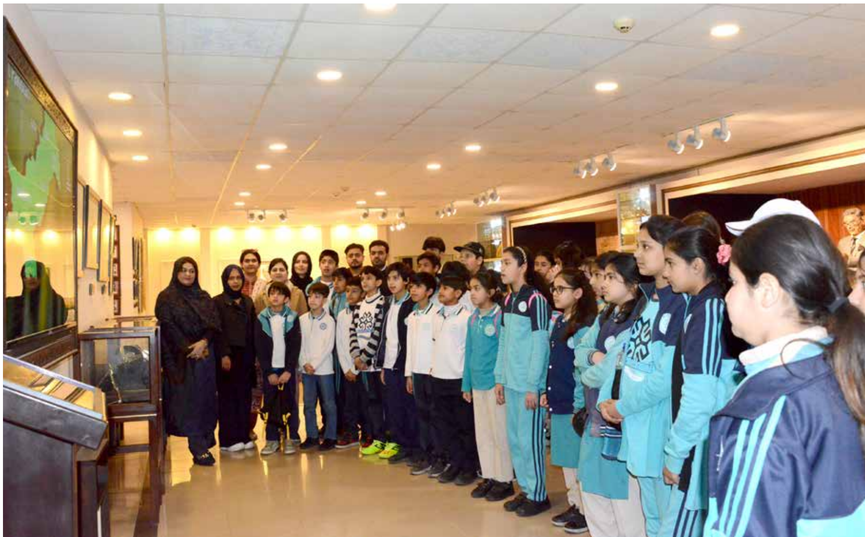
ISLAMABAD: Students and faculty members from International Maarif Schools visit Senate museum at Parliament house.