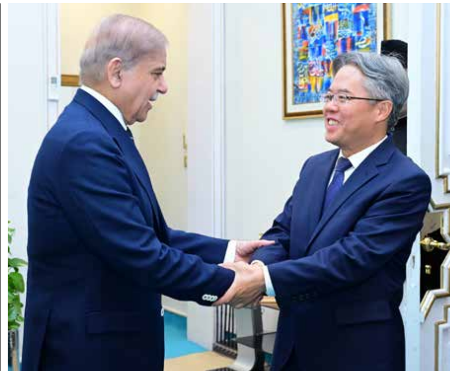
ISLAMABAD: Chinese Ambassador to Pakistan Ambassador Jiang Zaidong calls on Prime Minister Muhammad Shehbaz Sharif.