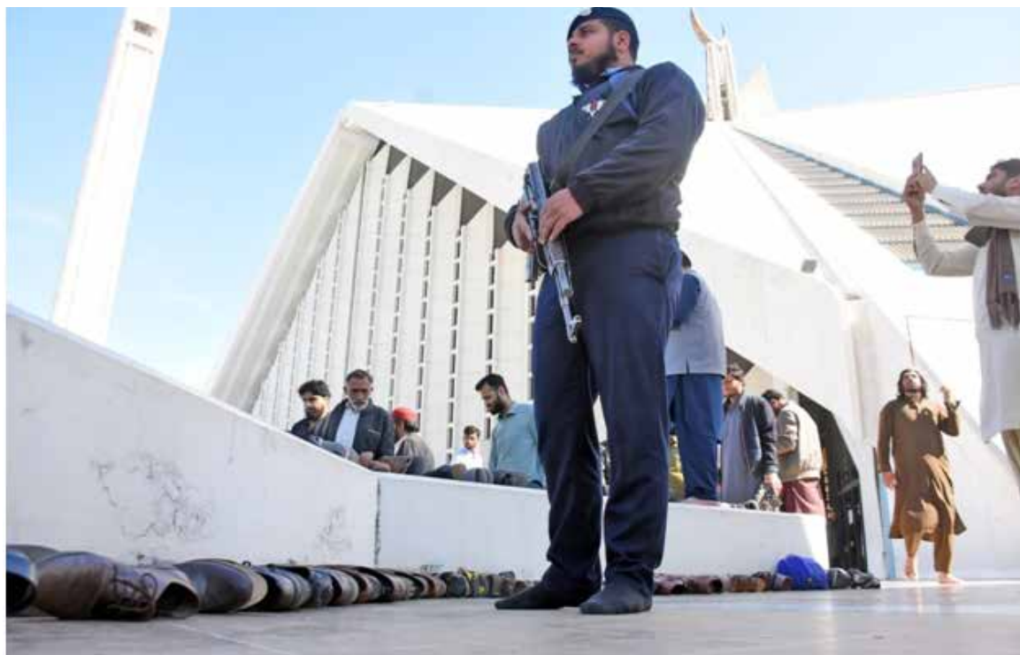
ISLAMABAD: A Police personal stand guard to counter any unexpected situation during the Nimaz-e-Juma at Shah Faisal Mosque.