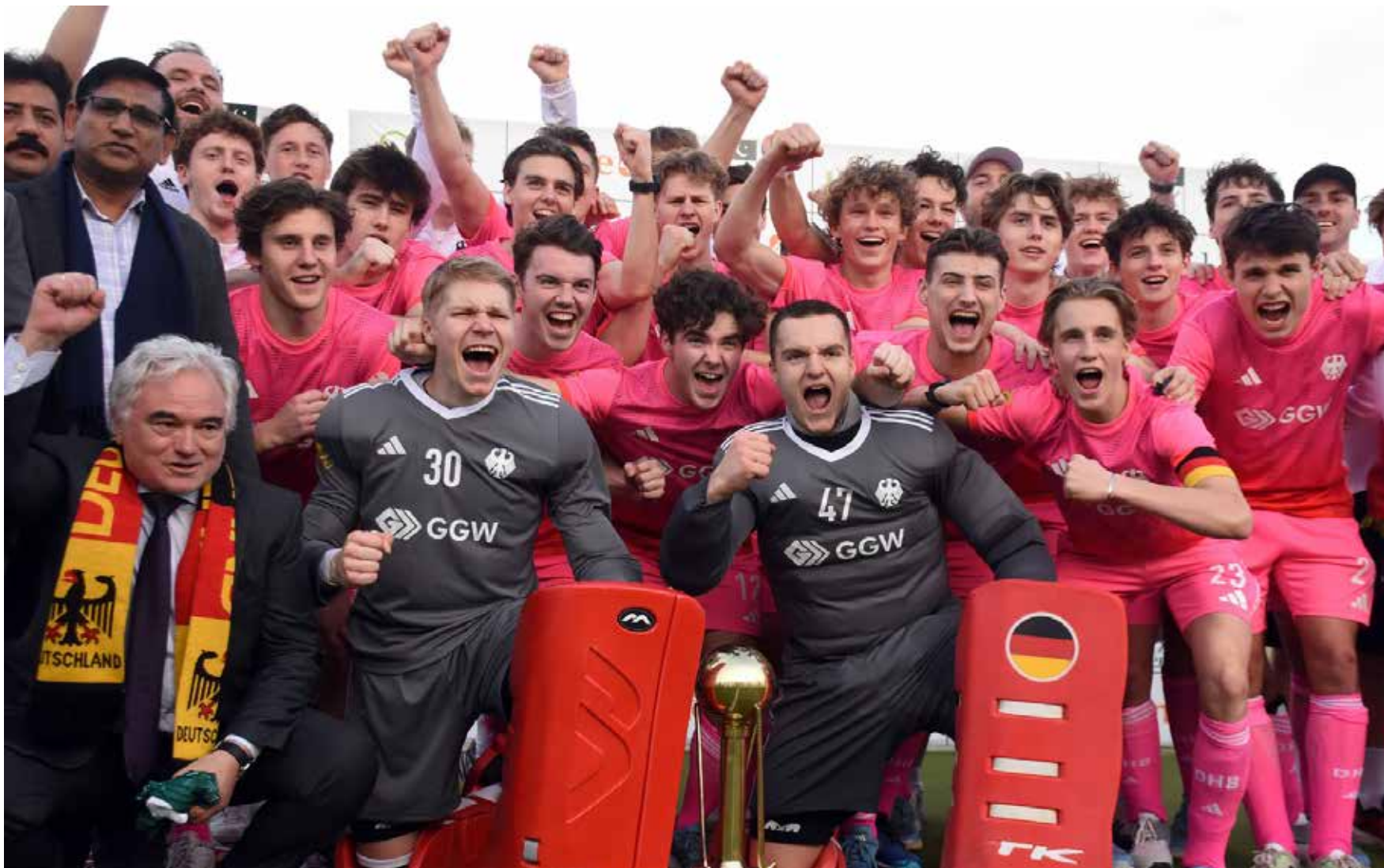
ISLAMABAD: German Ambassador to Pakistan, Alfred Grannas celebrating with German Hockey Team after defeating Pakistan in Juniors Hockey Team at Sports Complex in Federal Capital.

FROM PAGE 01 up in a vehicle near the FC camp. Interior Minister Mohsin Naqvi paid tribute to the security forces for repulsing the attack and killing the terrorists. He said that the nation was standing by the security forces to eliminate the terrorism from the country. The latest attack came only a day after security forces killed all 33 attackers who had hijacked the Jaffar Express train in Balochistan's Bolan and held passengers hostages in the mountainous region.