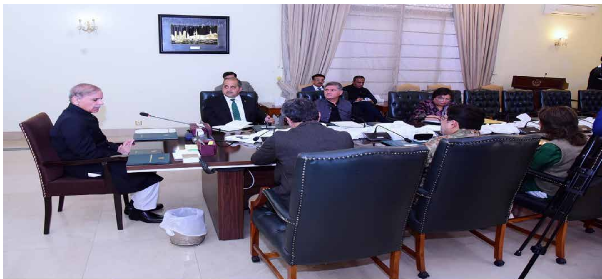
Islamabad: Prime Minister Muhammad Shehbaz Sharif chairing a review meeting on the matters related to Power Division.

ISLAMABAD: In a sweeping effort to curb overpricing during Ramadan, the Islamabad's district administration has reported detaining over 1,678 shopkeepers and sealing 42 stores across the Federal Capital between March 1 and 20. The Islamabad Capital Territory (ICT) administration's officials carried out 11,329 inspections, issuing fines totaling Rs 2.74 million for violations related to substandard goods and inflated prices. Meanwhile, six Ramadan bazaars and 20 fair-price shops were established to stabilize costs for essen-