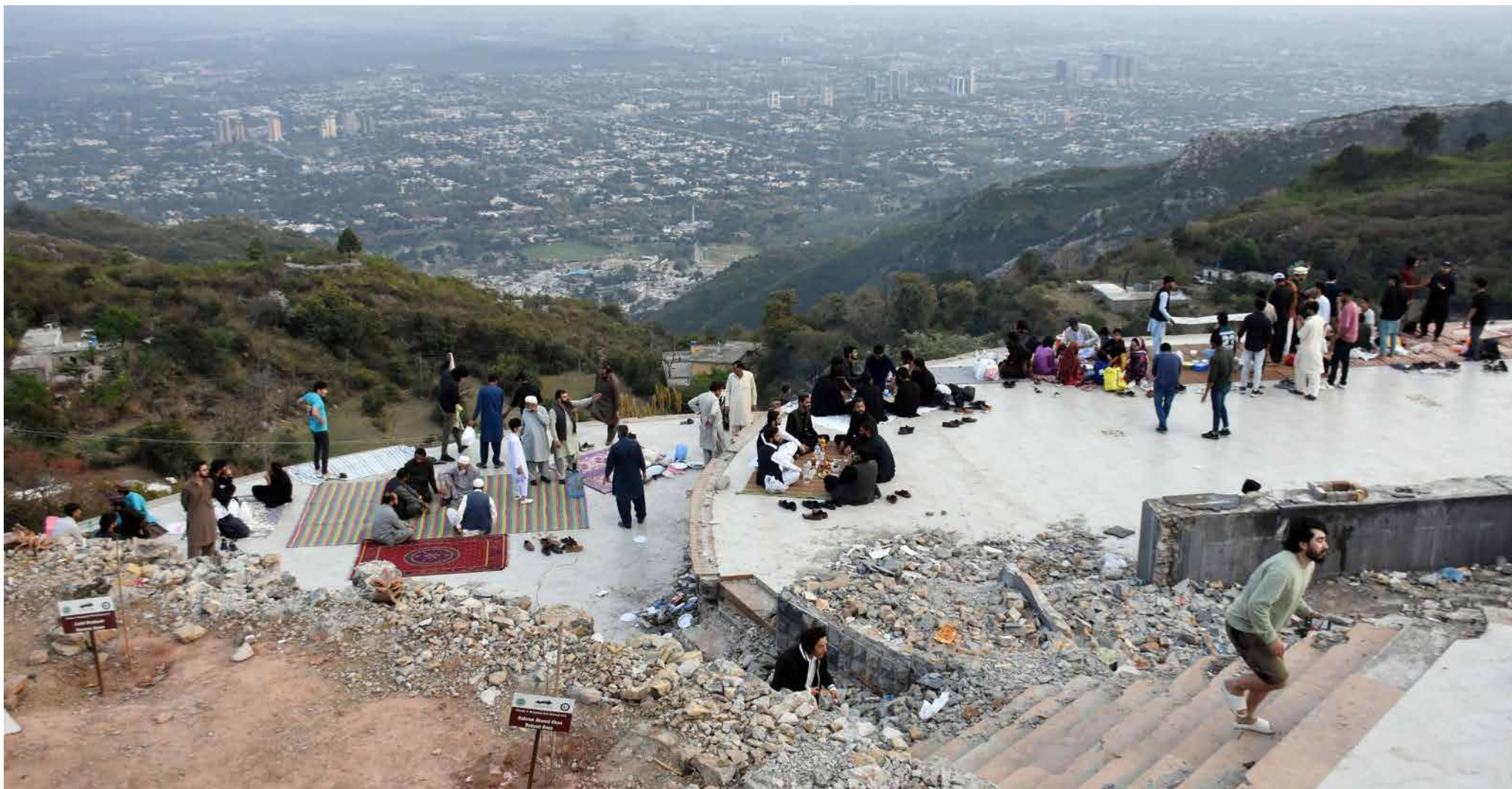
ISLAMABAD: A large number of people are having the Iftar at the broken Former Monal Resturent Site in on the debris of building at Margalla Hills, in Federal Capital.

FROM PAGE 01 revised the buyback rate from NAPP to Rs10 per unit. Furthermore, the committee approved the proposal, subject to the ratification of cabinet, to allow NEPRA to revise this buyback rate periodically, ensuring that the framework remains flexible and aligned with evolving market conditions. It was clarified, however, that the revised framework will not apply to the existing net-metered consumers who had a valid license, concurrence, or agreement under Nepra.