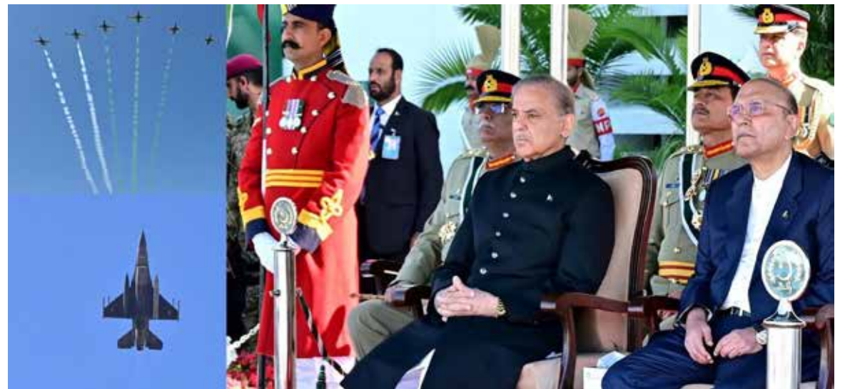
ISLAMABAD: President Asif Ali Zardari, Prime Minister Shehbaz Sharif, Chairman Joint Chiefs of Staff Committee General Sahir Shamshad and Army Chief General Asim Munir witnessing fly-past by the PAF jets, on the occasion of Pakistan Day celebrations.