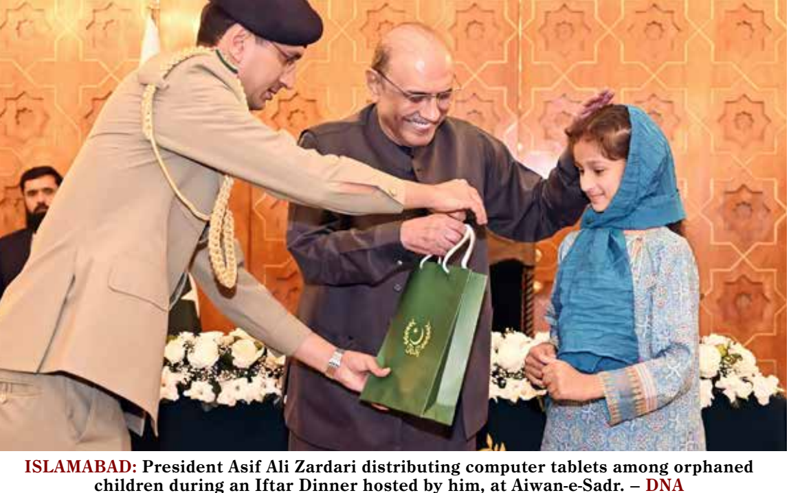
children during an Iftar Dinner hosted by him, at Aiwan-e-Sadr.