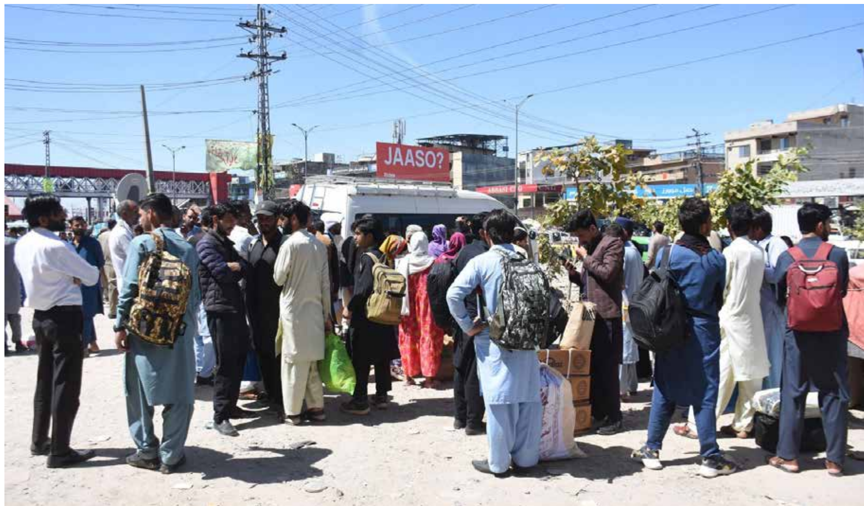
ISLAMABAD: A view of the hustle and bustle of passengers at Faizabad bus station as large number of people are going back to their native areas to celebrate upcoming grand event Eid-ul-Fitr with their beloved Ones.

GAZA CITY, Palestinian Territories: Israel's military admitted Saturday it had fired on ambulances in the Gaza Strip after identifying them as "suspicious vehicles," with Hamas condemning it as a "war crime" that killed at least one person. The incident took place last Sunday in the Tal Al-Sultan neighborhood in the southern city of Rafah, close to the Egyptian border. Israeli troops launched an offensive there on March 20, two days after the army resumed aerial bombardments of Gaza following an almost two-month-long truce. Israeli troops had "opened fire toward Hamas vehicles and eliminated several Hamas terrorists," the military said in a statement to AFP. "A few minutes afterward, additional vehicles advanced suspiciously toward the troops... The troops responded by firing toward the suspicious vehicles, eliminating a number of Hamas and Islamic Jihad terrorists. —APP