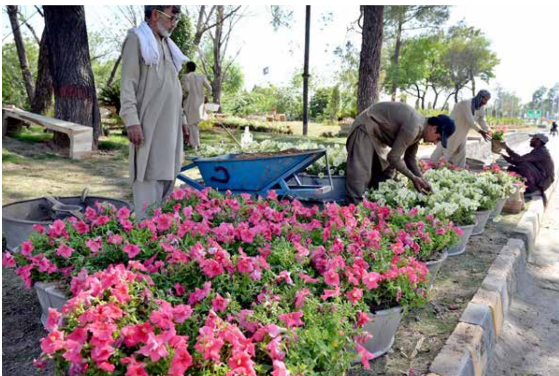
ISLAMABAD: Workers are busy placing plants in pots along the roadside in the Federal Capital.

ISLAMABAD: Notable cybersecurity experts Sunday stressed the importance of collective efforts from parents, educators and stakeholders to mitigate the adverse effects of digital influences on young minds, who are often overlooked by their families and instead find guidance online. Former Additional Director General of the Federal Investigation Agency Ammar Jaffri, while speaking to PTV News, explained Pakistan's cyber-crime wing and its efforts to combat online threats, emphasizing the need for collective action from all stakeholders. Ammar Jaffri also emphasized the need for strict checks and balances to combat cybercrimes and ensure online safety. The establishment of the NCCIA was approved by the federal cabinet in December 2023, and it's a significant step towards enhancing cybersecurity in Pakistan, he added. The Federal Government has activated the National Cyber Crimes Investigation Agency (NCCIA) to tackle online fraud cases and raise awareness about cybercrimes with an aim to enhance cybersecurity and protect citizens from online threats. —APP