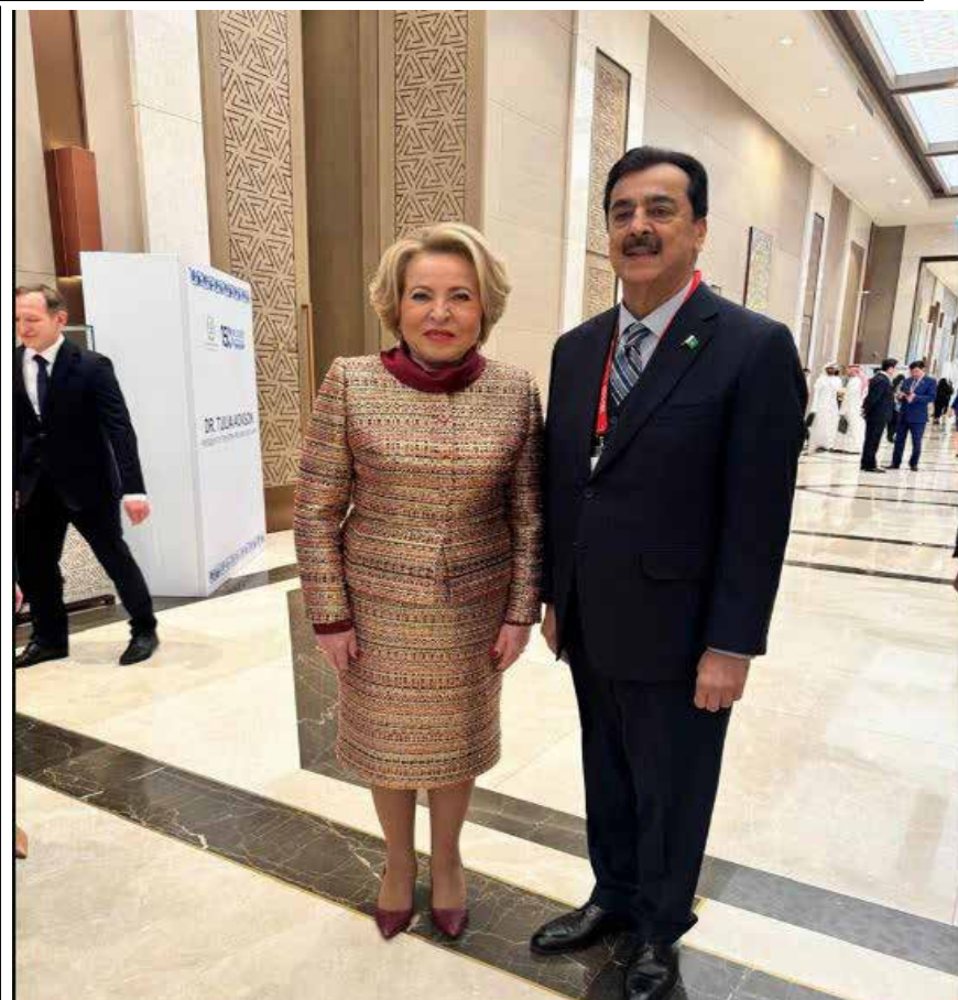
TASKKENT: Chairman Senate Syed Yousaf Raza Gillani met with Speaker of the Federation Council of the Federal Assembly of the Russian Federation Valentina Matvienko on the sidelines of the 150th meeting Assembly of the Inter-Parliamentary Union.

BARCELONA, Spain: Tens of thousands of Spaniards marched in protests held across the European country on Saturday in anger over high housing costs with no relief in sight. Government authorities said that 15,000 marched in Madrid, while organizers said 10 times that many took to the streets of the capital. In Barcelona, the city hall said 12,000 people took part in the protest, while organizers claimed over 100,000 did. The massive demonstration of social angst that is a major concern for Spain's left-wing government was organized by housing activists and backed by Spain's main labor unions. The housing crisis has hit particularly hard in Spain, where there is a strong tradition of home ownership and scant public housing for rent. Rents have been driven up by increased demand. Buying a home has become unaffordable for many, with market pressures and speculation driving up prices, especially in big cities and coastal areas. A generation of young people say they have to stay with their parents or spend big just to share an apartment, with little chance of saving enough to one day purchase a home. High housing costs mean even those with traditionally well-paying jobs are struggling to make ends meet.—APP