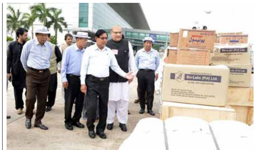
YANGON: Pakistan's second consignment handed over to Myanmar authorities at Yangon International Airport, Myanmar.