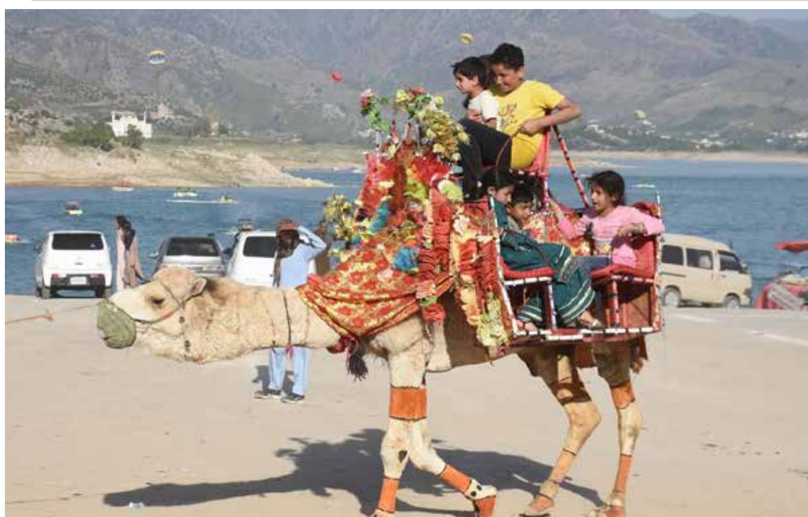
KHANPUR: Children are enjoying the ride of Camel at Khanpur Dam, which is a favorite destination of tourists from surrounding areas of the City.

IG Rizvi also instructed the CTO Islamabad to ensure effective traffic management, including the creation of alternative routes and parking arrangements, so that citizens do not face difficulties during the movement of players and matches. IG Rizvi reiterated that Islamabad Police would utilize all available resources to ensure the security of both foreign and domestic players and maintain law and order across the city. He added that protecting the lives and property of citizens remains among the top priorities of Islamabad Police. As the country grapples with rising inflation and economic challenges, this decision marks a turning point in the government's efforts to support businesses and ease the financial burden on consumers. The leadership of BMP looks forward to continued dialogue with the government to ensure that such pro-business and pro-growth measures are sustained and expanded, further advancing Pakistan's economic prosperity.