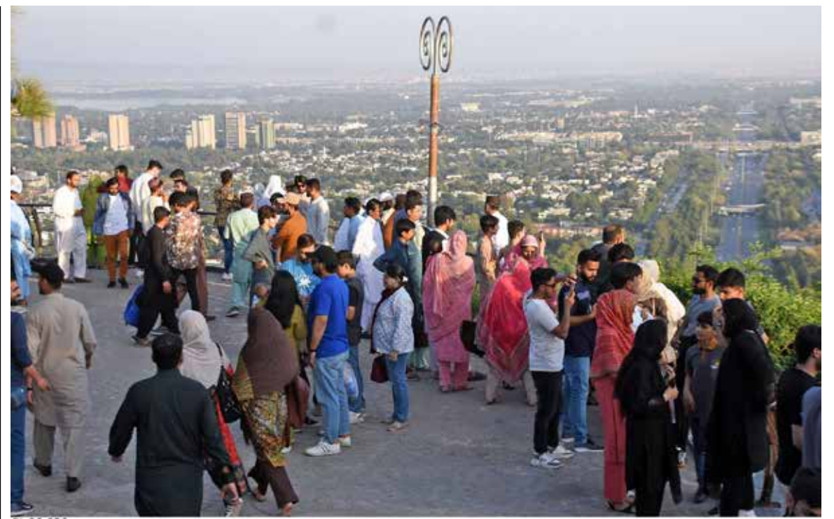
ISLAMABAD: People are enjoying Sunday holiday at Damn-e-Koh in the Federal Capital.

promote the positive impact of sports in society. The CM stated, "International Day of Sport for Development and Peace aims to raise awareness about the importance of sports in our communities and its contribution to peace." The chief minister emphasized the government's commitment to providing equal sports opportunities to all individuals, including youth, senior citizens, differently-abled people, and those from underdeveloped areas. "Sports events pave the way for peace and development within society," she said, adding that promoting social development and peace within communities was the core essence of celebrating this day. She further noted that peace and sports are inseparable. Where there is peace, there will be sports, and where there is sports, there will be peace. Highlighting the role of sports in youth development, she mentioned, "Sports play a vital role in nurturing teamwork, competition, and resilience among youth." The CM pointed out the steps taken by the Punjab government to promote sports in the province, including the launch of the "Khalita Punjab" program, aimed at increasing participation in sports. "The Pink Games in Punjab symbolize peace and equal development," she added.