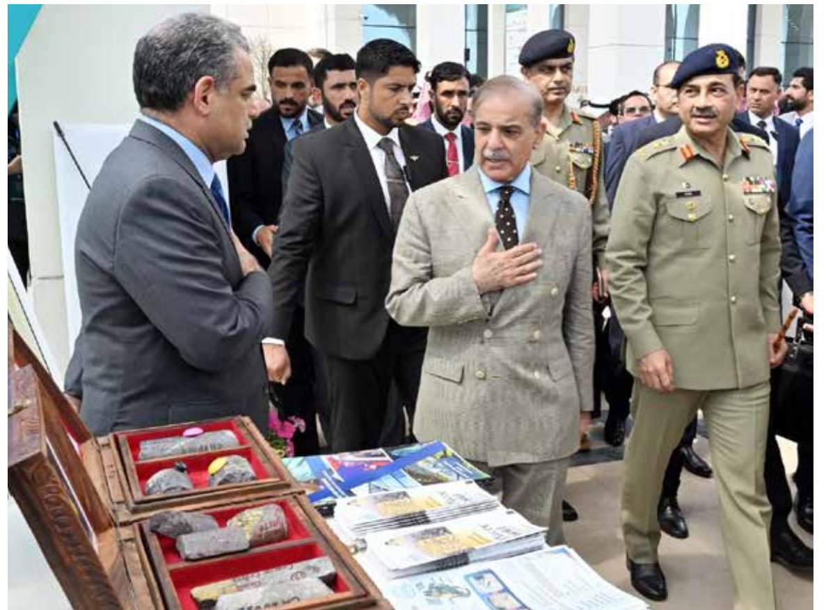
ISLAMABAD: Prime Minister Muhammad Shehbaz Sharif visiting stalls at the exhibition organized during the the Pakistan Minerals Investment Forum 2025.