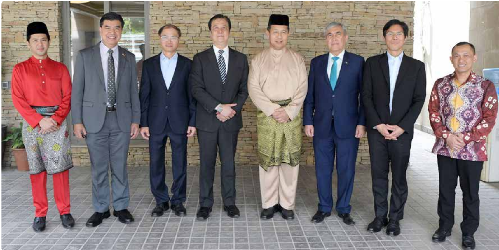
ISLAMABAD: High Commissioner of Brunei Kamal Ahmad hosted Eid get-together at the new Brunei High Commission. Seen in the picture are Ambassadors of Vietnam, Myanmar, Ambassadors-designate of Thailand, the Philippines, and Charge d Affaires of Embassies of Indonesia and Malaysia. Dean of the Diplomatic Corps is also present on the occasion. — DNA