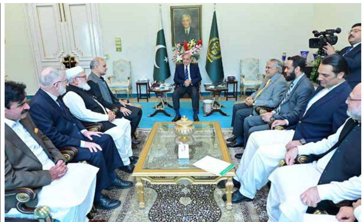
ISLAMABAD: A delegation of the Jamat-e-Islami led by its ameer Hafiz Naeem Ur Rahman called on Prime Minister Muhammad Shehbaz Sharif. — DNA