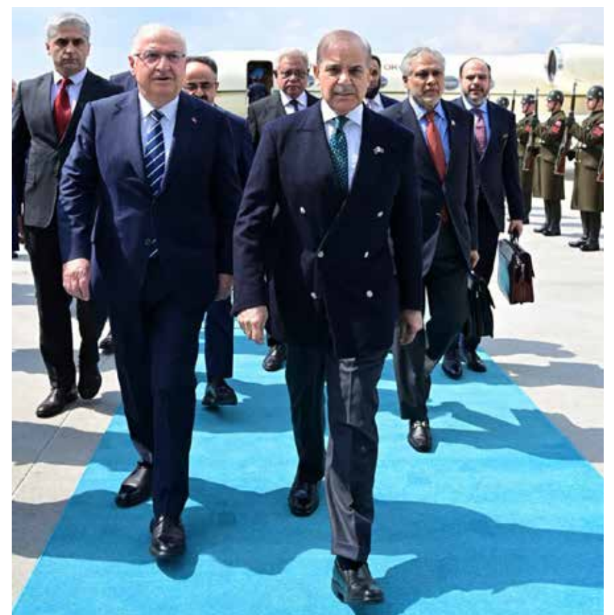
ANKARA: Prime Minister Shehbaz Sharif being received by Minister of National Defense of Turkiye Yashar Guler upon arrival.