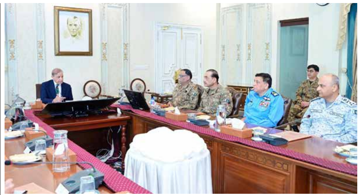
ISLAMABAD: Prime Minister Muhammad Shehbaz Sharif chairing a meeting of the national Security Committee.

Indian soldier arrested on Pakistani soil