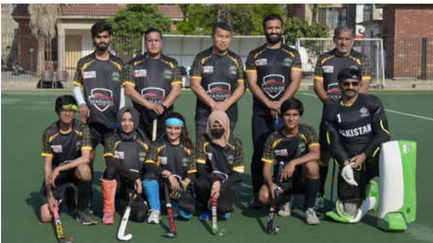
R.S Warriors spearheaded by the High Commissioner of Brunei Kamal Ahmad