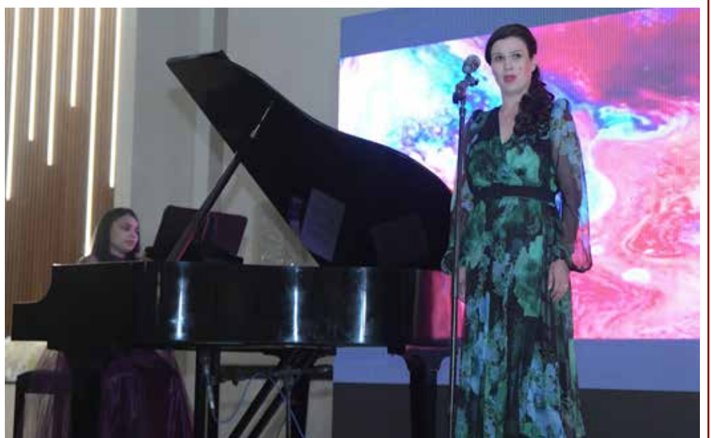
ISLAMABAD: Francophone artists perform on the occasion of Francophone Talents contest.

The “Francophone Talents” contest and its associated events were a celebration of cultural dialogue, artistic creativity, and the enduring spirit of the Francophonie community across the globe. The guests thoroughly enjoyed a rich array of traditional dishes from various Francophone countries, each offering a unique taste of its cultural heritage. Among the many culinary delights, the Moroccan dishes stood out and attracted huge crowds. Dishes such as Tagine, Couscous, and Pastilla were particularly popular, celebrated for their richness, aromatic spices, and distinctive flavors. The slow-cooked Tagine, with its tender meats and blend of sweet and savory ingredients, captivated many with its depth of flavor. Couscous, often referred to as Morocco's national dish, impressed guests with its light texture and the vibrant mix of vegetables and spices. Meanwhile, the delicate and flaky Pastilla, a savory pie combining layers of meat, almonds, and a hint of sweetness, offered a culinary experience unlike any other. The Moroccan cuisine's use of exotic spices like saffron, cumin, cinnamon, and preserved lemons created an unforgettable sensory experience. Many guests were seen returning for second servings, praising not only the rich tastes but also the authenticity and warmth that Moroccan food brought to the evening.