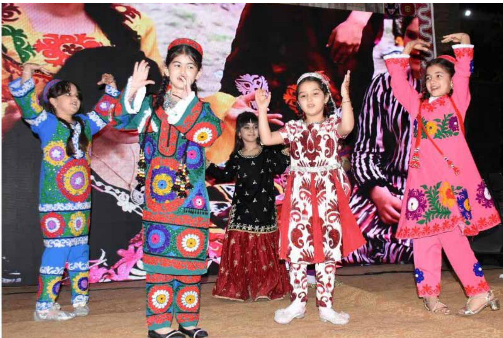
ISLAMABAD: Children performing tableau during Int'l Nowruz Holiday celebration organized by Tajikistan Embassy.

BEIJING, Apr 26 (APP): The world's wind industry installed a record 117 GW of new capacity in 2024, and China led the world in new installations both onshore and offshore, ahead of the US, Germany, India and Brazil respectively rounding out the top 5, the Global Wind Report 2025 released by Global Wind Energy Council (GWEC) said. According to the report, in 2024, newly grid-connected wind power in China reached nearly 80 GW, surpassing the previous installation record set in 2023. Cumulative wind power installed capacity was over 520 GW, accounting for almost half of the world's total. By the year-end, the installed capacity of wind power and solar PV power generation reached 1,400 GW, exceeding thermal power capacity for the first time in China's history, CEN reported on Saturday. The reports also mentioned that the clean energy sector, including renewables, nuclear power, electricity grids, energy storage. —APP