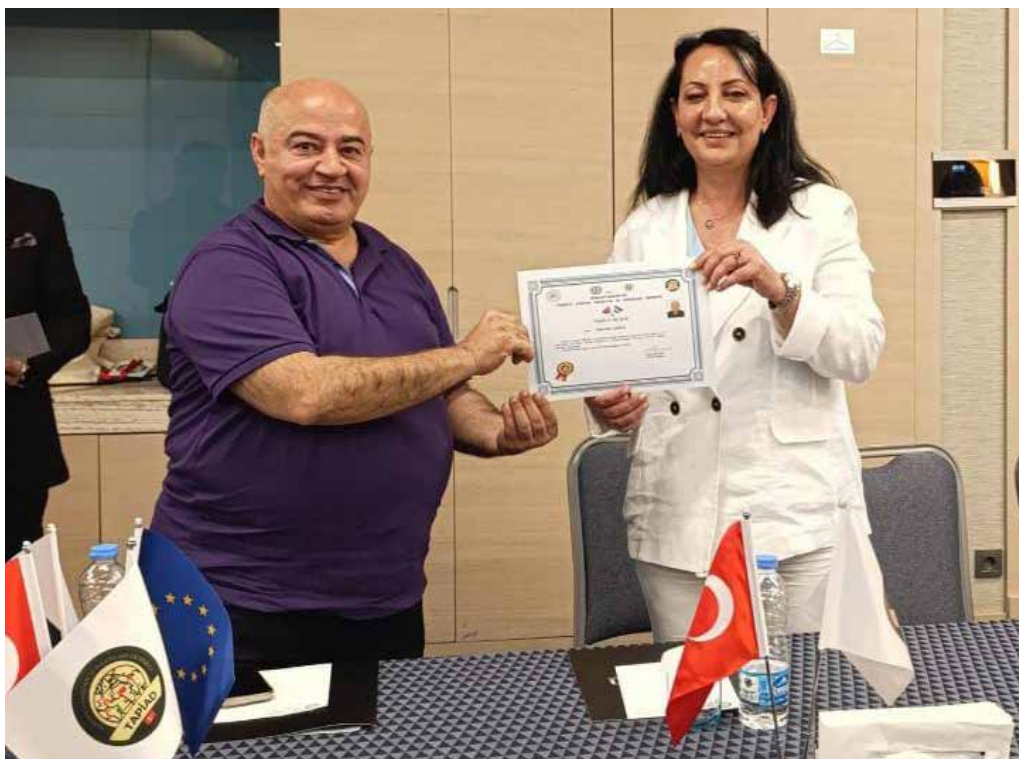
GUJRAT: Female entrepreneur from Türkiye visited Gujrat Chamber of Commerce and Industry. She had fruitful meetings with the President and other office bearers. Both sides determined to enhance business relations.