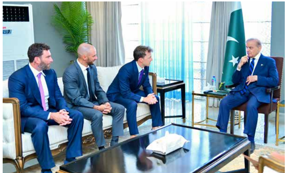
ISLAMABAD: A delegation of the American financing company World Liberty Financial called on Prime Minister Muhammad Shehbaz Sharif in Islamabad.