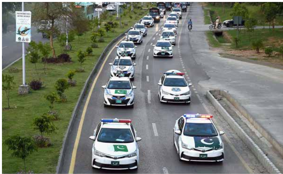
ISLAMABAD: Islamabad Police holding Thanksgiving Day Rally to express solidarity with Pakistan Armed Forces.

that authorities arrested at least ten people on Sunday for allegedly solving teacher recruitment exam papers at the hujra of provincial minister Pakhtunyar. Acting on Deputy Commissioner Muhammad Fahim's orders, the teams of district Administration, along with police, raided the hujra situated in Mirakhel Police Station jurisdiction. The operation uncovered that the ETEA-conducted education department exam papers were being solved there. Recovered items included today's exam papers, answer sheets, a laptop, a computer, and a printer. All those arrested have been turned over to the local police for legal proceedings, and ETEA has been notified for further action. The move underscores efforts to ensure a fair and merit-based recruitment process. The raiding team also recovered today's exam papers, answer sheets, a laptop, a computer, and a printer at the scene. ETEA has been informed about the raid. This move was seen as crucial for maintaining fairness in the teacher recruitment process.