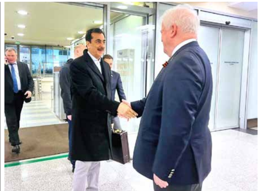
MOSCOW: Chairman of the Senate of Pakistan, Syed Yousuf Raza Gilani is being received upon his arrival at Moscow, Russia, by Vladimir Chizhov, Head of the Group for Cooperation between the Federation Council of the Russian Federation and the Senate of Pakistan.