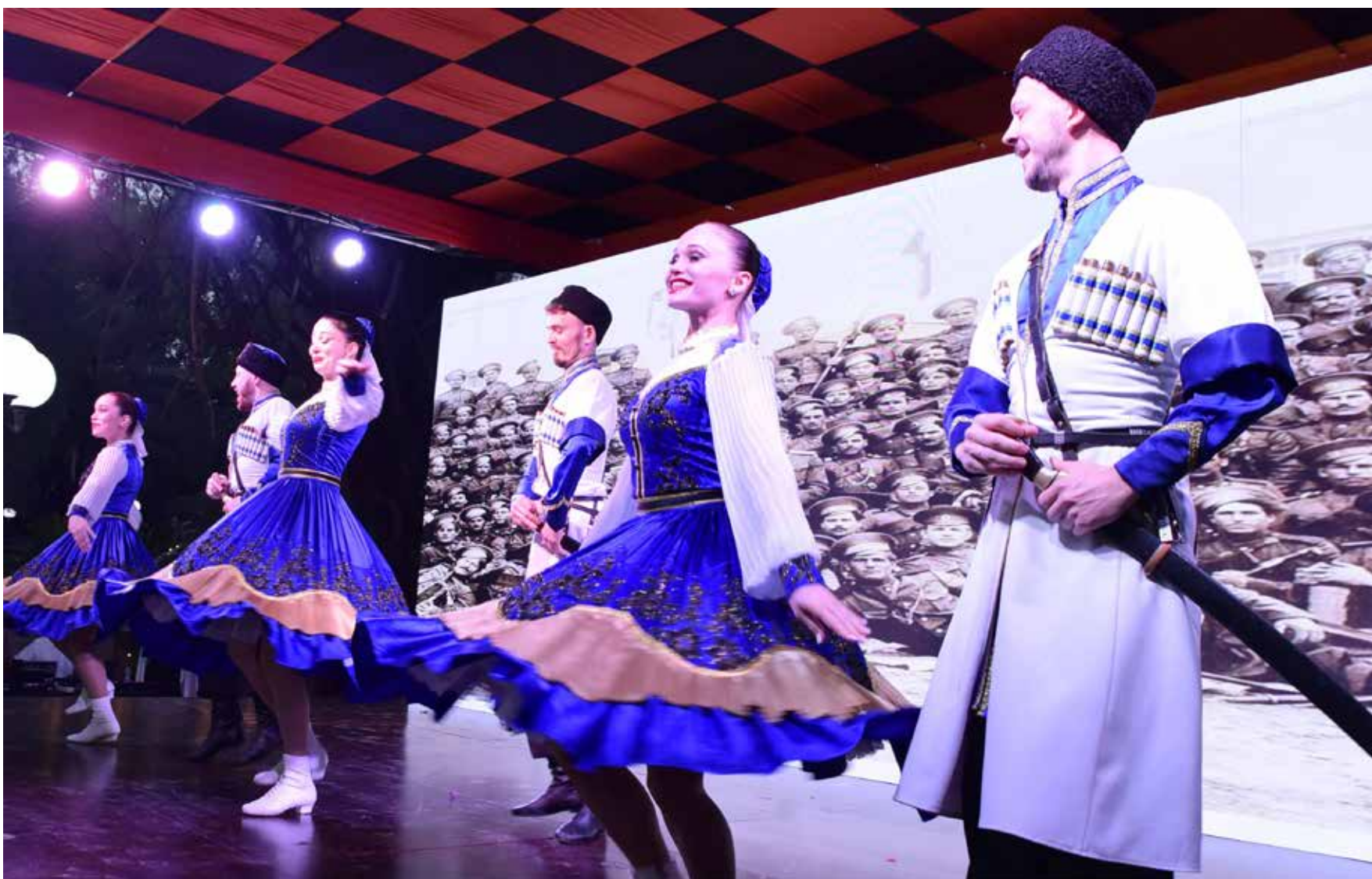
ISLAMABAD: Russian artists perform cultural dances during an event held in the Capital the other day.