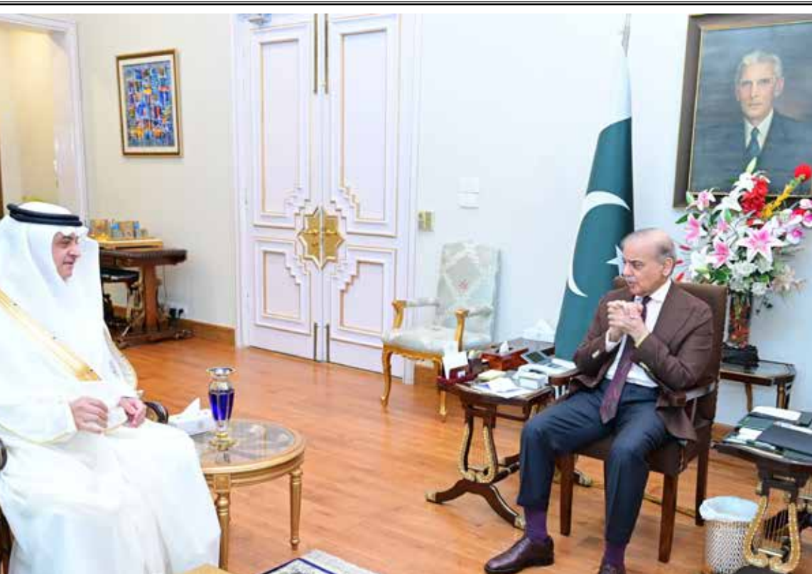
ISLAMABAD: Ambassador of Saudi Arabia to Pakistan Nawaf bin Saeed Al-Maliki called on Prime Minister Shehbaz Sharif at PM House.