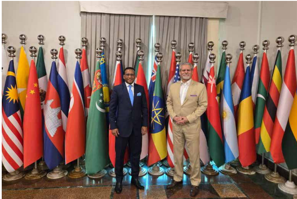
a High-Level Business Forum “Invest In Ethiopia”, scheduled for