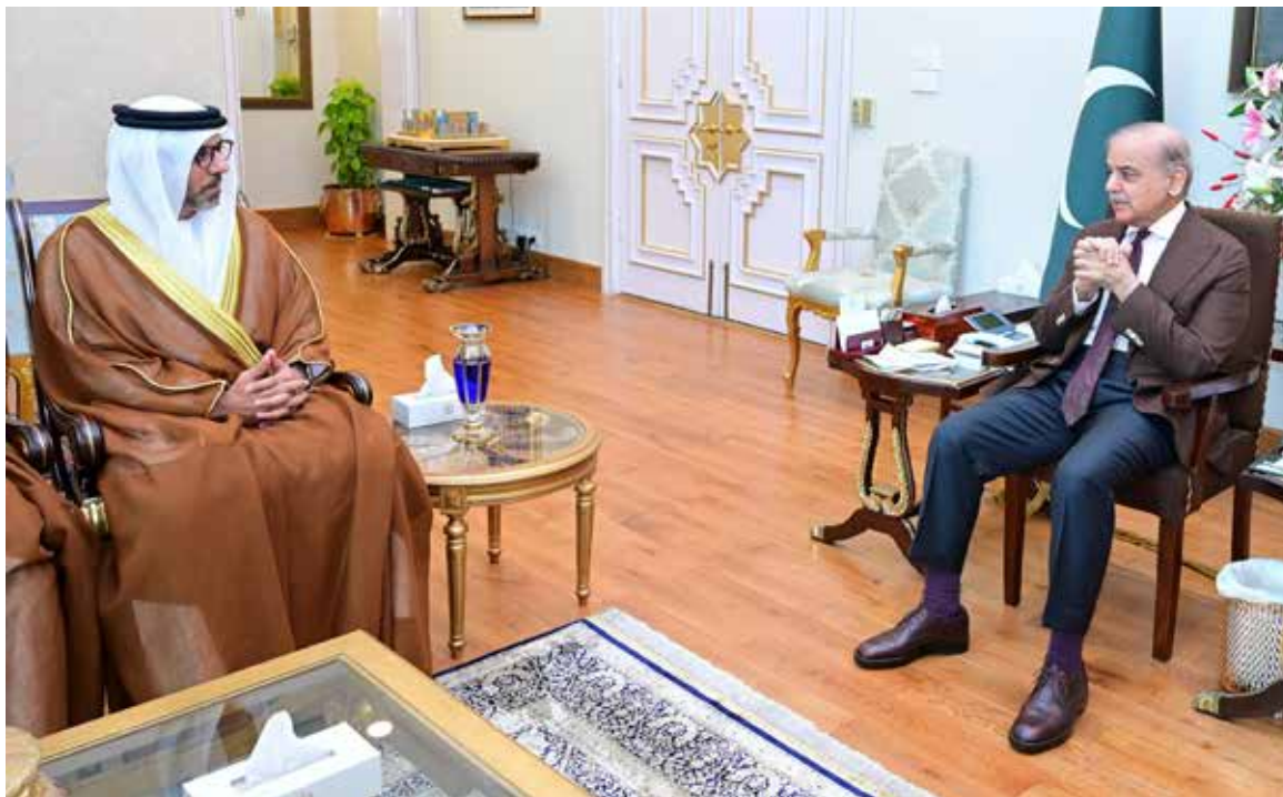
ISLAMABAD: Ambassador of UAE to Pakistan H.E. Hamad Obaid Ibrahim Salem Al-Zaabi called on Prime Minister Muhammad Shehbaz Sharif in Islamabad on 2 May 2025.

Top military determined to thwart aggression