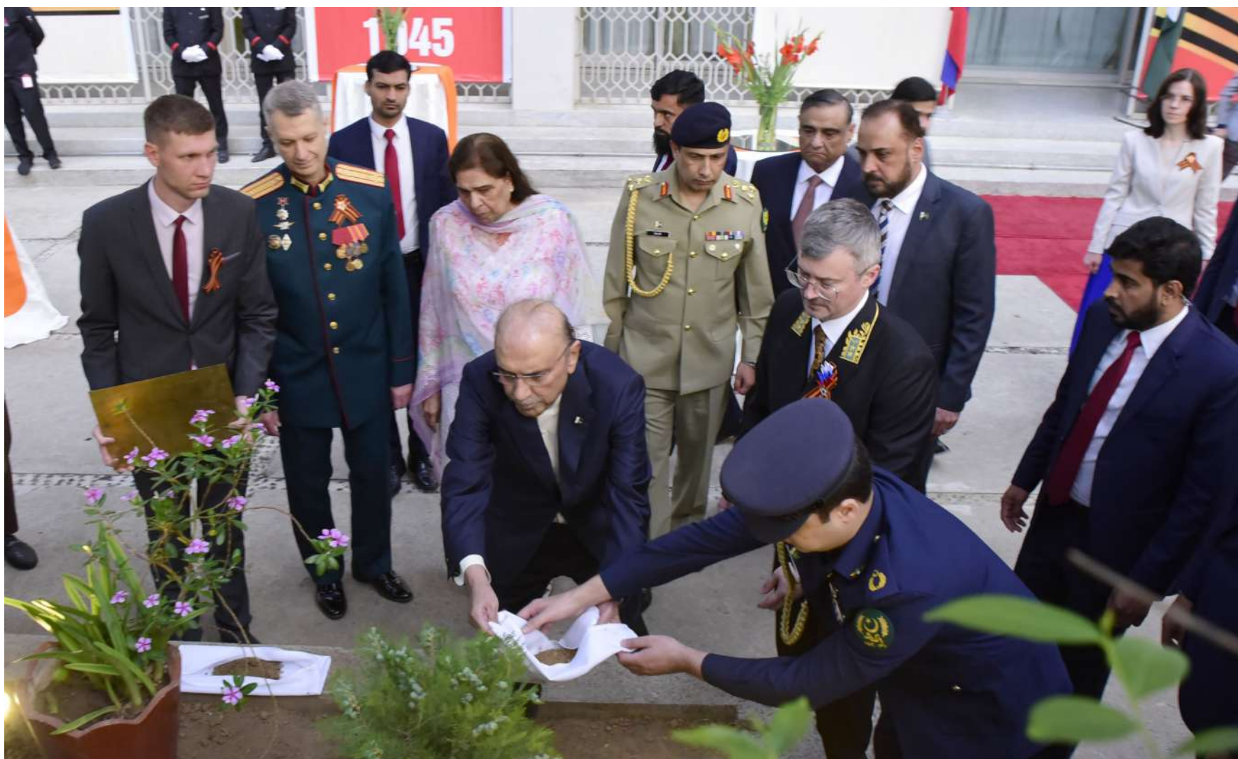
ISLAMABAD: President Asif Ali Zardari plants a saplings at the Russian embassy on the occasion of victory day celebrations. Ambassador of the Russian Federation and Defence Attache also seen in the picture.