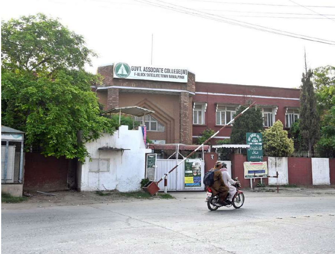
RAWALPINDI: A view of Government Associate College for Women, closed after the government announced the closure of all educational institutions due to the current situation.